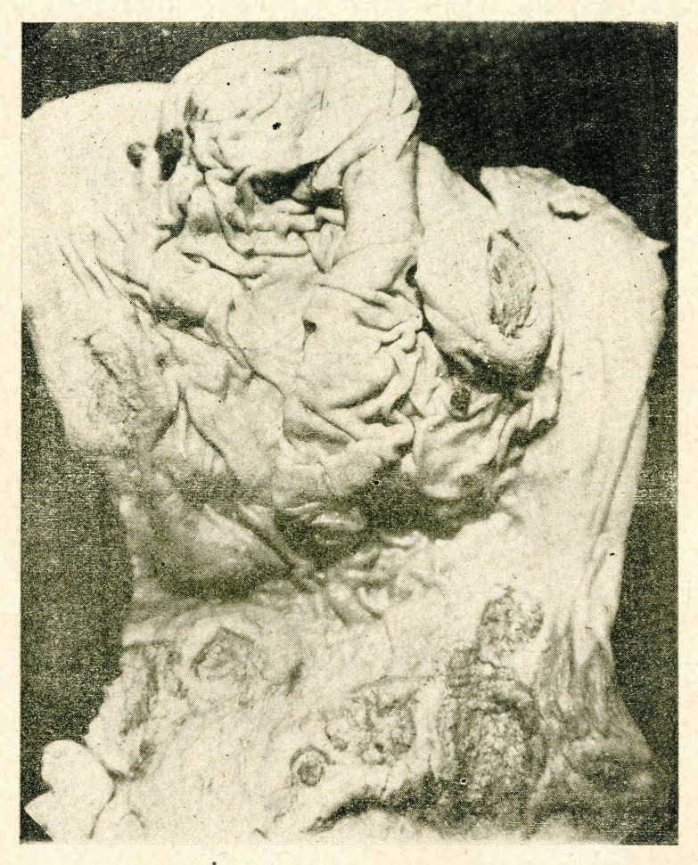
Fig. 4. A Portion of the Cecuim Slit Cpen Longitudinally So As to Expose the Ulcerated Mucous Membrane

the lymphatic glands consist of enlargement and congestion. These changes vary from showing bright red lines of congestion to cases in which the glands are almost black. If cut into it will be found that the congestion has occurred principally in the exterior of the gland.