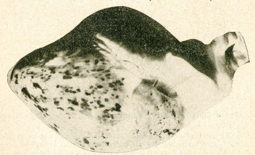
Fig. 1. Petechiae on the Heart of a hog Affected With Cholera

Heart. The heart as a rule shows very few lesions. In some of the cases, however, there may be numerous petechiae