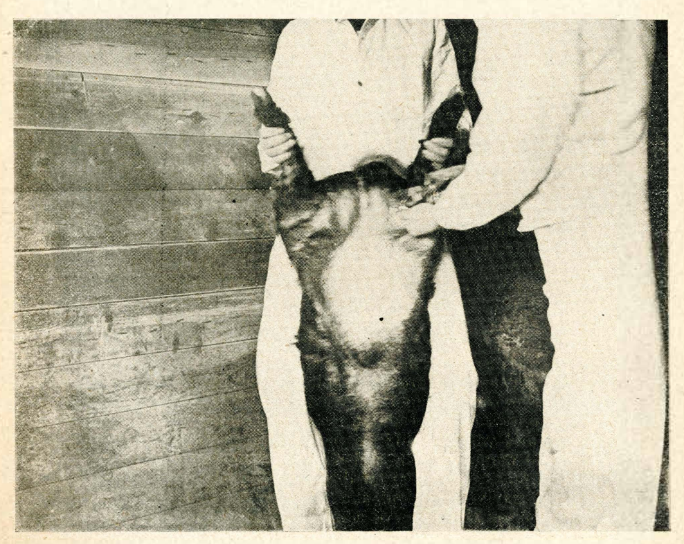
Fig. 5. Showing Method of Holding a Pig While Vaccinating

When cholera has already broken out in a drove of swine before any vaccination has been done the question comes up, which hogs are to be treated and which are not? As already noted potent serum merely protects the hogs from cholera and is in no way a cure for that disease. Hence, animals which show unmistakable signs of being affected with cholera are not to be treated because such treatment proves unsatisfactory. When once the animals are sick with the disease the use of serum has no effect in arresting its progress. If the