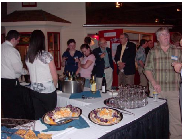
NCCVLD attendees were treated to an opening wine and cheese reception at the South Dakota Agricultural Heritage Museum on Wednesday, June 1.

In addition to the scientific sessions, participants were treated to a wine and cheese opening reception held at the South Dakota Agricultural Heritage Museum, an evening picnic at Oakwood Lakes State Park, and tours of the SDSU Animal Disease Research and Diagnostic Laboratory. ■