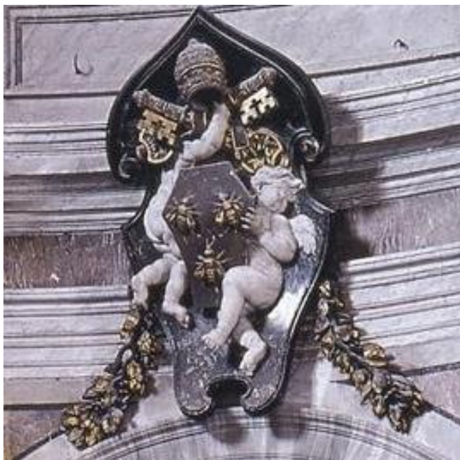
Figure 9 Detail of Barberini bees on papal coat of arms atop the tomb of Pope Urban VIII, 1627 - 1647 CE

The first layer of bees to discuss is that at the top of the piece: the large bees on the crest above the tomb (Figure 9). The base of the crest is inspired by Pope Urban VIII's family crest. Pope Urban's family crest is said to have originally been a horsefly, but as the family ascended the ladder of Italian society, they changed