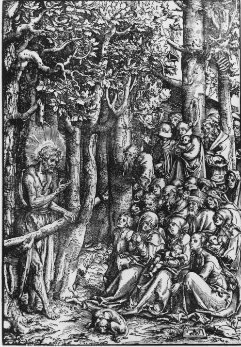
Figure 3 "John the Baptist Preaching in the Wilderness" by Lucas Cranach the Elder, 1516 CE

works, his zeal for nature and emotion is far more pronounced. The subjects of many of Cranach's early biblical prints are often found framed by thickly forested nature scenes. For example, in "John the Baptist Preaching in the Wilderness" (Figure 3)