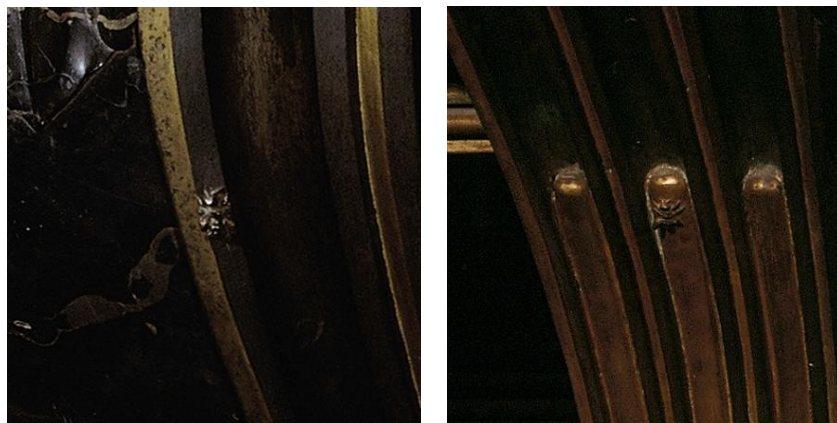
Figure 11 Detail of two of the one-inch bees on sarcophagus legs on tomb of Pope Urban VIII, 1627 - 1647 CE

bees, which were all placed on the work after the entire work was finished. As secret as the medium-sized bee crawling along the sarcophagus lid is, these bees are even more of a secret between artist and viewer as you have to be very close to the work to be able to see them. They have no definition or color variation from the surface that they were carved into, making them even harder to spot. These miniscule carvings are a very personal touch that Bernini seems to have left just for his friend and the rare viewer who cares enough to look for them. Two of these one inch bees would never even be seen by viewers as they are located on the back of the sarcophagus against the base of Pope Urban's statue, yet there they are. Every detail was taken into consideration.