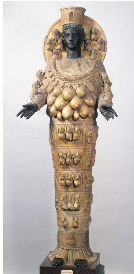
Figure 1 Artemis of Ephesus, 2nd century CE