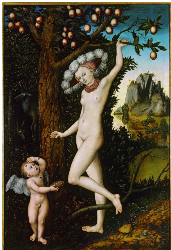
Figure 5 "Cupid Complaining to Venus" by Lucas Cranach the Elder, 1525 CE

Take, for instance, this earlier version of the same subject by Cranach. In this version of “Cupid Complaining to Venus” (Figure 5) it is immediately clear that we are not looking at the same composure and control that was told in the first version. The story told in this piece, though also challenging to the viewer’s morals, does not offer such a clearly guided path to the resolution that Cranach would like for his viewers to reach. Part of what is so challenging in this