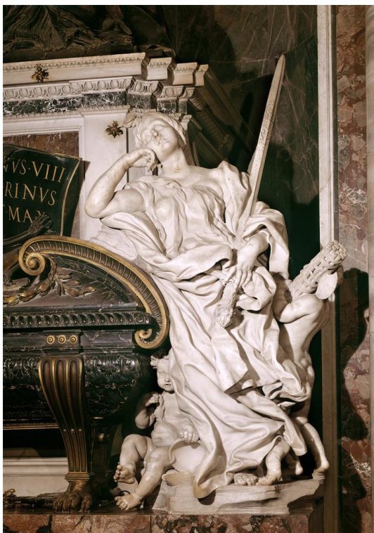
Figure 12 Detail of Justice on the tomb of Pope Urban VIII, 1627 - 1647 CE