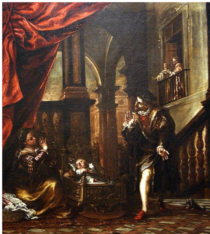
Figure 6 "The Miracle of the Bees" by Juan de Valdes Leal, 1673 CE