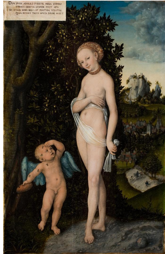
Figure 4 "Venus with Cupid Stealing Honey" by Lucas Cranach the Elder, 1530 CE

As Cupid was stealing honey from the hive,