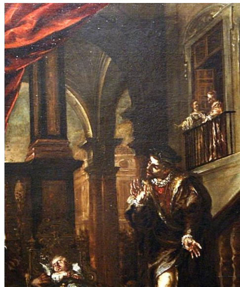
Figure 7 Detail of the architecture in "The Miracle of the Bees" by de Valdes Leal, 1673 CE

The setting of the scene is another aspect of this work that shows both Saint Ambrose and by Archbishop Spinola. While other pieces in this series fill the space with figures to pay attention to, this particular panel of the life of Saint Ambrose series allows the architecture of the scene to take center stage. While the actual scene of infant Saint Ambrose being swarmed by bees occupies a relatively small part of the canvas, the rest of the work is not lacking in significance. Above the scene soars the combination of Spanish arches and Moorish details so characteristic of the architecture of Seville (Figure 7). Although this altarpiece would only ever be on display in Archbishop Spinola's home, conveying the architecture of Seville conveyed the wealth and work that the archbishop had donated to building the city of Seville. Valdes Leon made a point to paint