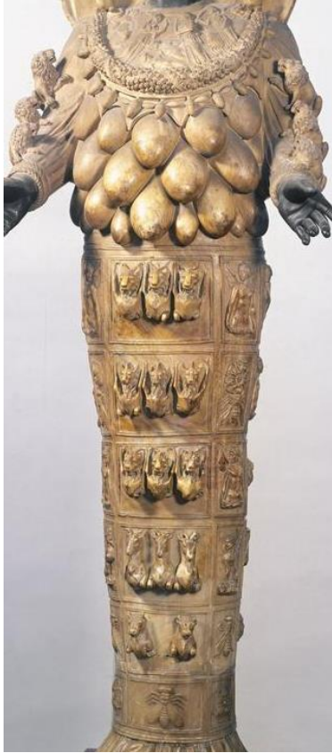
Figure 2 Detail of Artemis of Ephesus, 2nd century CE

This figure of Artemis of Ephesus is a 2 nd century roman copy of the 300 BCE original. In this, the most iconic depiction of Artemis of Ephesus, the goddess is seen wearing a thin dress covered by a heavy and elaborate apron. Upon the apron are depictions of the offerings which