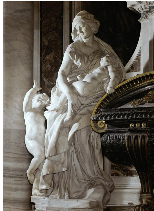
Figure 13 Detail of Love on the tomb of Pope Urban VIII, 1627 - 1647

The unprepared, disheveled look of the sculptures in this work leave the viewer with a sense of anticipation. It is as if at any moment Love scoops up the screaming child at her ankle and will straighten up long enough to pose for the sculpture, Death will finish carving his sign and affix it to the tomb, and Justice will heave her head off of her hand and stand at attention. The bees, too, bring with them a sense