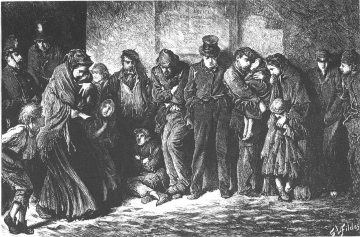
Fig 5. Houseless and Hungry. Sir Luke Fildes. 1869. The Graphic. http://www.victorianweb.org/art/illustration/fildes/1.html.