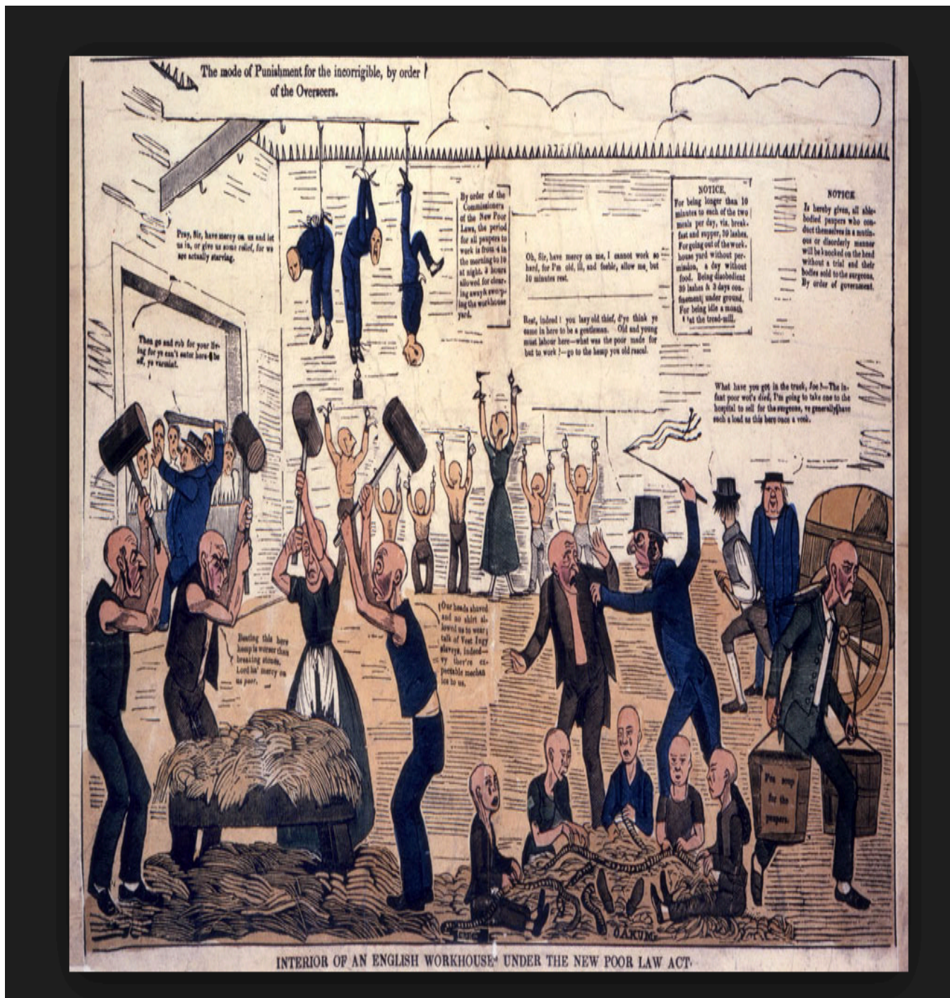
Fig. 4. Interior of an English Workhouse under the New Poor Law Act. Charles Jameson Grant. British Museum. www.britishmuseum.org/research/collection_online/collection_object_details.aspx?objectId=1614423&partId=1 .