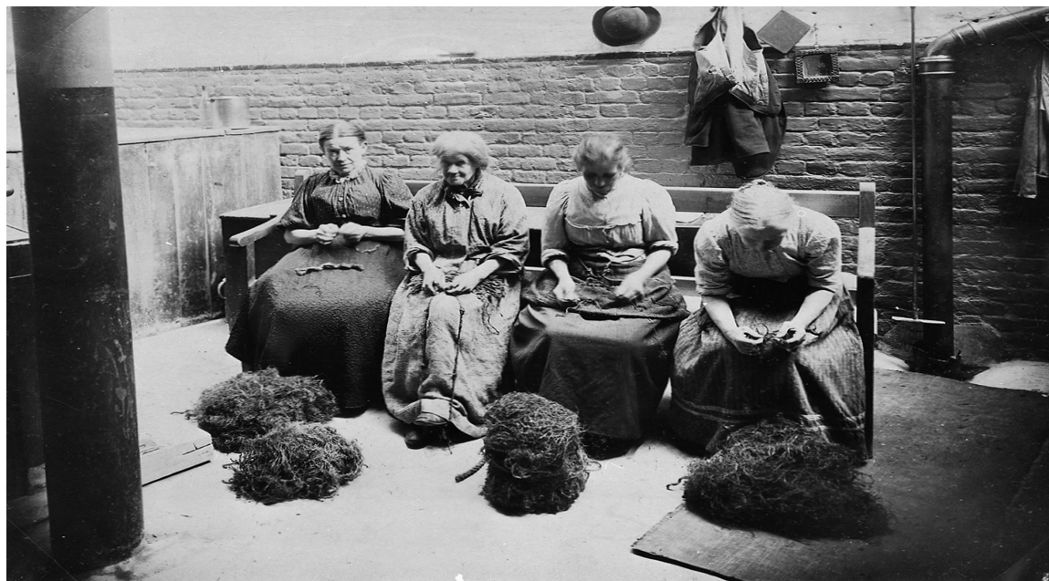
Fig. 3. Women Picking Oakum In The Workhouse .

by untwisting old rope. Inmates in prisons and men and women in workhouses were often put to work picking oakum. 122 At the Braintree Workhouse, each person had to pick half a pound of oakum in return for receiving half a pound of bread in the morning. No bread was given if the person refused to do the work. 123 Sometimes, a person would work eight to twelve hours a day just to earn enough to receive dinner in the workhouse. The process of picking oakum was wearisome. First, the rope was smashed with mallets to break it up into smaller pieces. These smaller pieces were then either put on hooks, which were held in place between the picker's knees, or just held in their hands. The idea was to break apart the series of strands that made up the rope so the individual fibers could be harvested. As there were no other tools available, patrons used their broken fingernails to pick it down to the individual fibers. It would be hard enough using fresh rope, but these ropes had been used at sea, and were therefore compacted, frayed, dirty, and covered in rust, salt, grease and tar. Getting them apart caused the finger pads to bleed ceaselessly and untreated cuts became infected from the dirt (e.g. Figure 3).