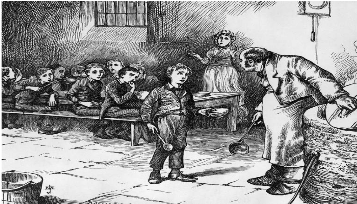
Fig 6. Oliver Twist Asking for More Food. https://www.thoughtco.com/oliver-twist-review-740959.

Through his novels and other papers, author Charles Dickens eloquently described his perception of Britain as it lurched forward during the Industrial Revolution. As such, he became a renowned and respected chronicler of the Victorian experience. Many of his works detail the misery suffered by the indigent and their attempt to find a better life.