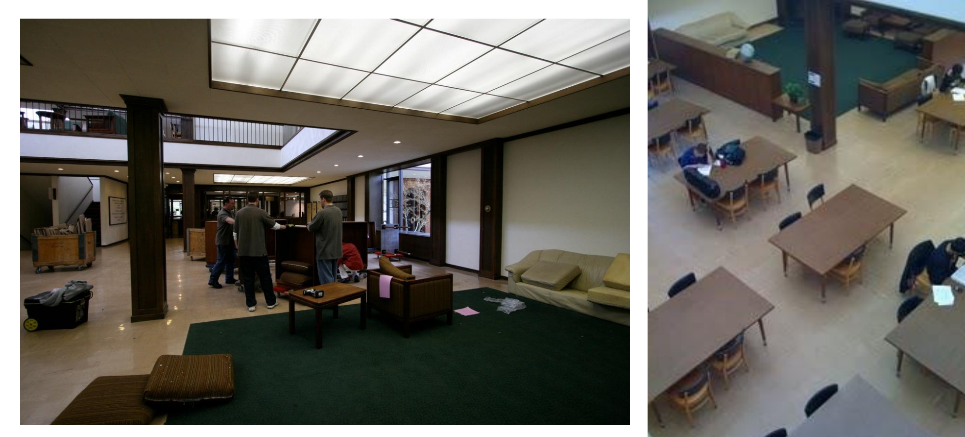
From the before to the after pictures—how the reading room was transformed