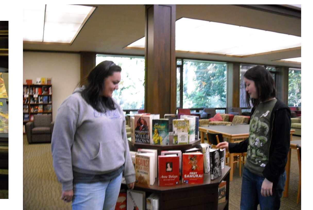
Browsing the Kiosk