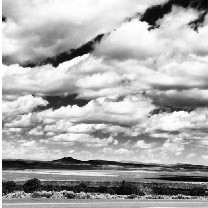
Figure 13: New Mexico Landscape , 2015 by Michelle L. Knutson

After visiting the home and studio of Georgia O’Keeffe, I was inspired to make the image, New Mexico Landscape , 2015, while driving through the desert to her other main New Mexico residence, Ghost Ranch. The New Mexico landscape is indeed inspiring, with layers of color and texture that are even evident in this black and white image. In editing this image, I heightened the contrast, thus highlighting the dark darks and light whites of the landscape, interspersed with variations of grays. The effect gives the image an intensity that demonstrates the emotion provoked by the gorgeous landscape. Like O’Keeffe’s paintings of sky, most of the frame is taken up by layers of clouds. Here, they recede toward the background mountain which delineates the bottom portion of the frame, merging into the layers of gray.