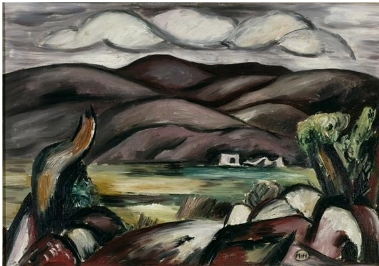
Figure 11: Landscape, New Mexico, 1923 by Marsden Hartley

unreachable, already missed encounter with the landscape.” 17 In Landscape, New Mexico, 1923 (Figure 11), the melancholy atmosphere is pervasive. Where O’Keeffe’s landscapes of the same subject matter (see Figure 6, for example) are vibrant and full of bright color, Hartley’s are more subdued, exhibiting his personal views of the history of the land. “Where Hartley’s painting of New Mexico culminated in complex and painful dislocation of the recollections, O’Keeffe’s New Mexico works were rooted in her experience of the landscape.” 18