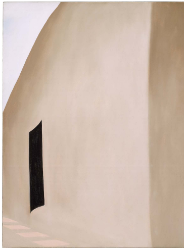
Figure 4: Patio with Black Door , 1955 by Georgia O’Keeffe

While living in New York, O’Keeffe could not help but be inspired by the mammoth shapes of the skyscrapers and tall buildings. Her work, City Night , 1926 (Figure 3) is similar to Arthur Dove’s painting Silver Tanks and Moon , 1930 (Figure 9) in its composition, but O’Keeffe’s lines are more defined and clean. Though both paintings depict the full moon shining between large structures, the later O’Keeffe work is more closely related to the high contrast and monochromatic photography, like the work of her husband, Alfred Steiglitz. However, unlike the Dove painting, O’Keeffe’s work feels stifled and claustrophobic, perhaps a reaction to life in New York City. Once she discovered the New Mexico landscape, the emotionality of her architectural paintings changed. She felt more serene and calm in that raw and free Southwestern environment and her paintings reveal that.