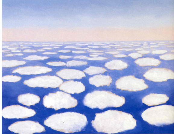
Figure 2: Above the Clouds I , 1962-63 by Georgia O'Keeffe

It is safe to assume the Georgia O'Keeffe painted what she saw, whatever was in front of her. So when she was living in New York City, she was moved to depict the monumental structures of the skyscrapers and when she was living in New Mexico, she was inspired by the humble adobe structures of the native people who inhabited the region.