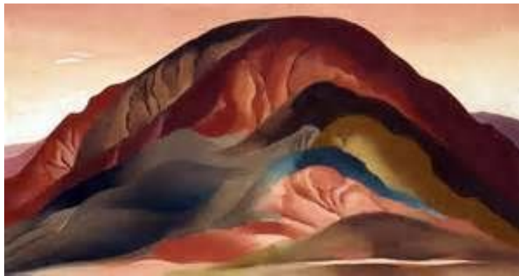
Figure 6: Rust Red Hills , 1930 by Georgia O’Keeffe

In addition to depicting the unique architecture of the Southwest, O’Keeffe created many paintings of the singular landscape. For example, Red Rust Hills , 1930 (Figure 6) displays dynamic colors and lines which distills the subject matter, almost to the point of abstraction. It “...appears to be bold, abstract, horizontal gestures in brown, black and red - until the title reveals the subject. The painting displays rounded undulating forms of layered hills, divided by shifts in light and darkness that confuse reading of flatness or depth, and illustrates the artist’s’ personal perspective of the New Mexico hills” 8