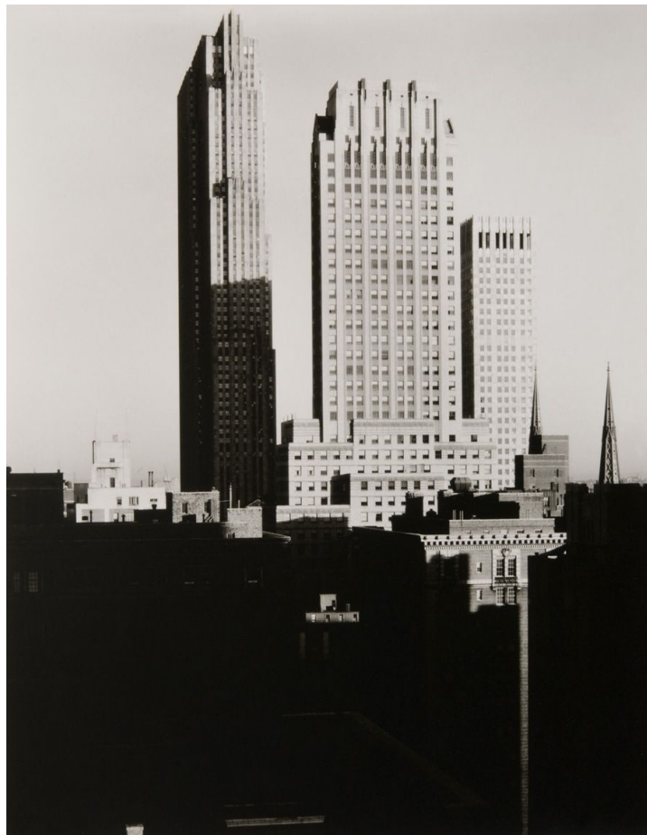
Figure 8: New York from the Shelton , 1933-35 by Alfred Stieglitz

O’Keeffe felt less comfortable in the big city, as is evident in her depictions of New York. For example, in City Night , 1926 (Figure 3), the skyscrapers rise up but lack a solid foundation. Their shapes create diagonal lines that lean towards each other and feel almost to meet out of frame, creating a crowded atmosphere, as if the viewer will be swallowed up by the city. In her painting, the light of the moon shines on one building in the background, creating a bright shape to look towards, a sign of hope amid the claustrophobic scene.