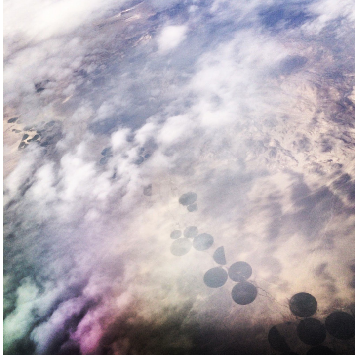
Figure 14: From Above , 2015 by Michelle L. Knutson

Flying home from New Mexico, I was inspired again by the cloud paintings of Georgia O’Keeffe. In From Above (Figure 14), I emphasized the fractured light and geometric shapes below, thus flattening the frame into an abstract composition. There are circular shapes in the lower right portion of the frame that feel out of place and give the image a certain mystery. The viewer is forced to question what they see. The subject matter is distilled into mere shapes and lines.