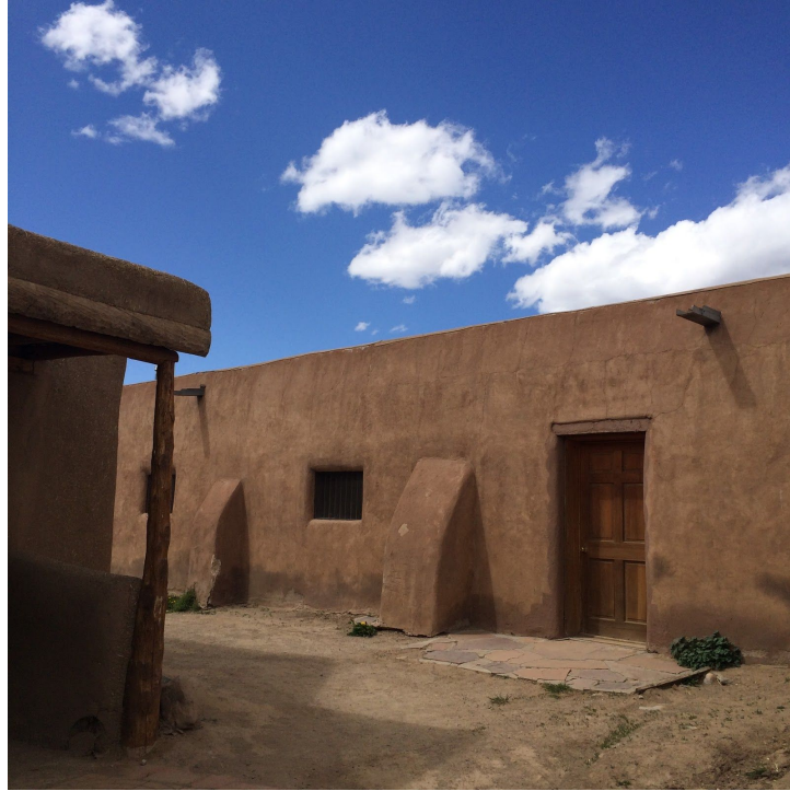
Figure 12: Taos Pueblo, New Mexico , 2015 by Michelle L. Knutson

The life that Georgia O’Keeffe created for herself in New Mexico is as inspiring as her artwork. She prided herself on keeping things simple: “My house in Abiquiú is pretty empty; only what I need is in it, I like walls empty. I’ve only left up two Arthur Doves, some African sculpture and a little of my own stuff.” 20