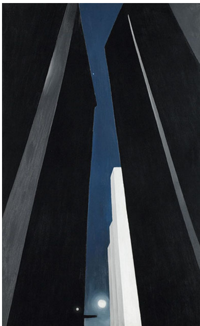
Figure 3: City Night , 1926 by Georgia O'Keeffe

It is safe to assume the Georgia O'Keeffe painted what she saw, whatever was in front of her. So when she was living in New York City, she was moved to depict the monumental structures of the skyscrapers and when she was living in New Mexico, she was inspired by the humble adobe structures of the native people who inhabited the region.