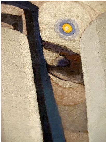
Figure 9: Silver Tanks and Moon , 1930 by Arthur Dove

There are many works between the two artists that seem to correspond and it is obvious they each drew inspiration from the other. “O’Keeffe’s City Night , 1926 (Figure 3) and Dove’s Silver Tanks and Moon , 1930 (Figure 9), for example, make use of the same compositional format, with their phallic thrust of architectural forms illuminated by the glow of a full moon.” 14 However, as discussed earlier, O’Keeffe’s painting feels tighter and more crowded while the brilliance of Dove’s moon and the lighter colors he uses give the painting a more optimistic emotion.