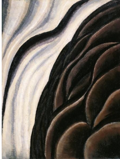
Figure 10: Sea Gull Motive (Sea Thunder or The Wave) , 1928 by Arthur Dove