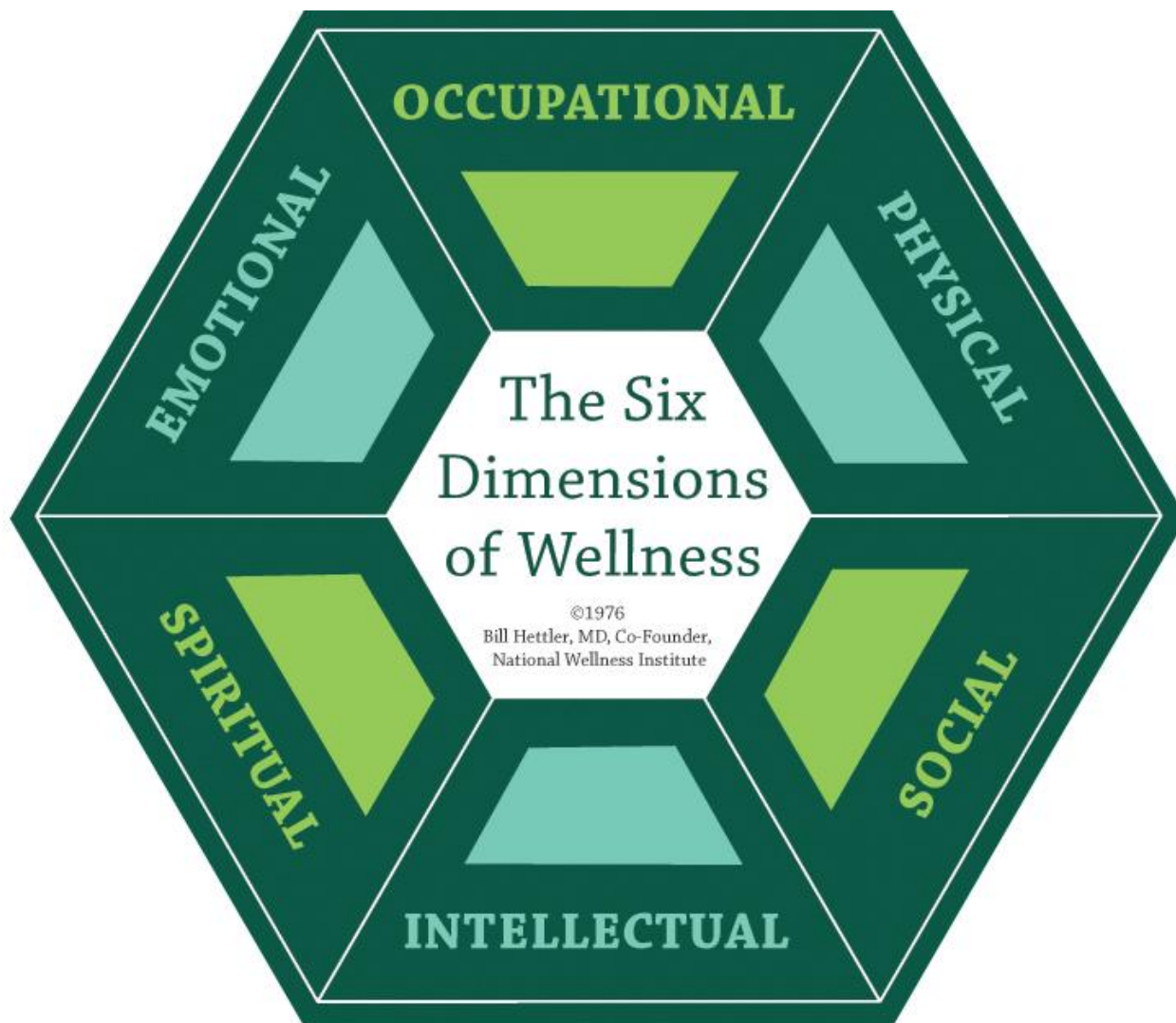
Figure 2. Six Dimensions of Wellness (National Wellness Institute, 2012)