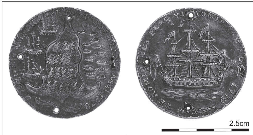
Figure 2. Rhode Island Ship Token from the Amsterdam privy.