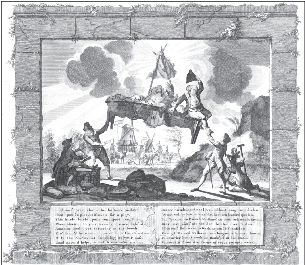
Figure 5. Satire of the English, who were not only involved in a struggle on the American continent but also in Europe. Contemporary engraving, published in the Fourth Volume of the city history by Jan Wagenaar from 1802 (Image courtesy of Bureau Monumenten & Archeologie).