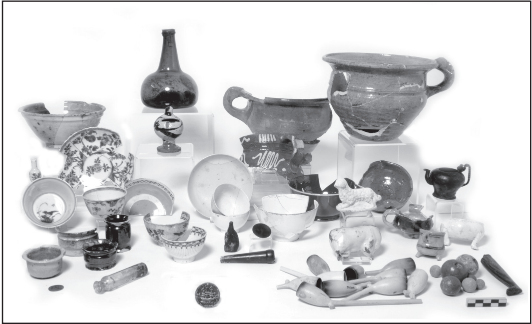
Figure 3. The Rhode Island ship token amidst a selection of artifacts from the Oudezijds Armsteeg privy (Photo by W. Krook, Bureau Monumenten & Archeologie).

The token has a diameter of 3.2 cm and a weight of 8 grams (FIG. 2). It was tested at the Koninklijke Nederlandse Munt (Royal Netherlands Mint) in Utrecht and found to be an alloy of tin and lead—pewter.