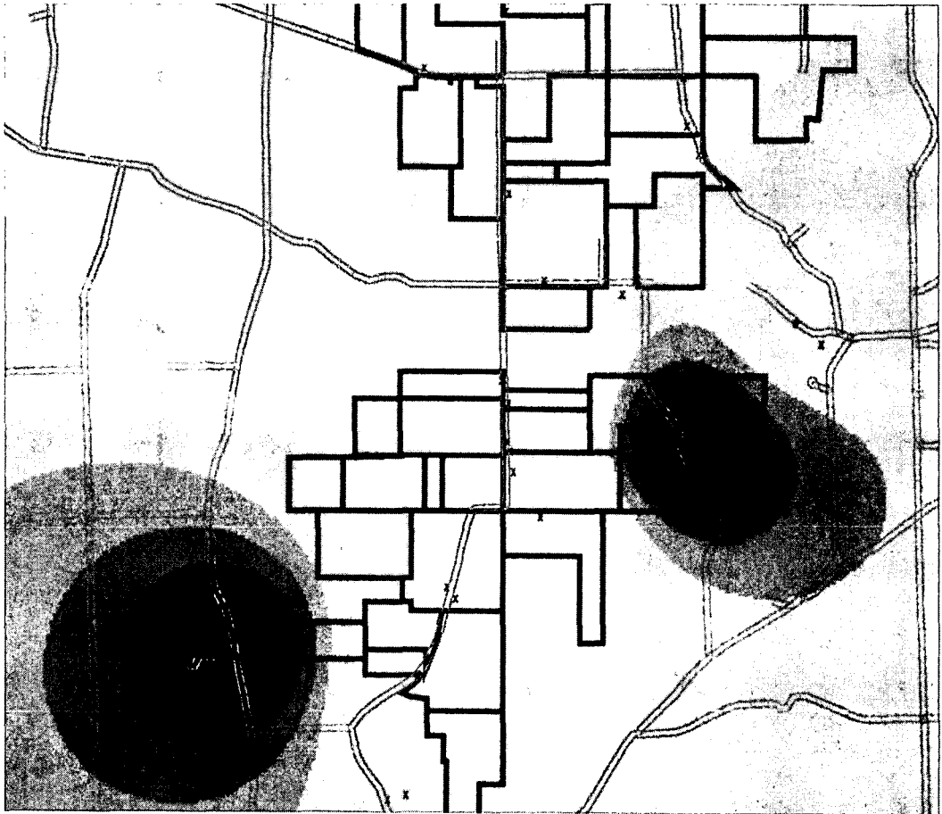
Figure 1. Density plot of the total artifact assemblage recovered from the Burnt Hill Study Area. The two dark areas represent the areas of highest artifact concentration.

It is clear from an examination of the surface density that there are two distinct zones of high concentration in the Burnt Hill Study Area. On the western side of the forest artifacts