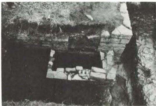
Figure 2. Window well exposed in the 1983 excavations of the Barrack Master's Office and Quarters.

and other offal and food debris was deposited as far away from its source as possible, for both sanitary and "odoriferous" reasons (South 1977:179).