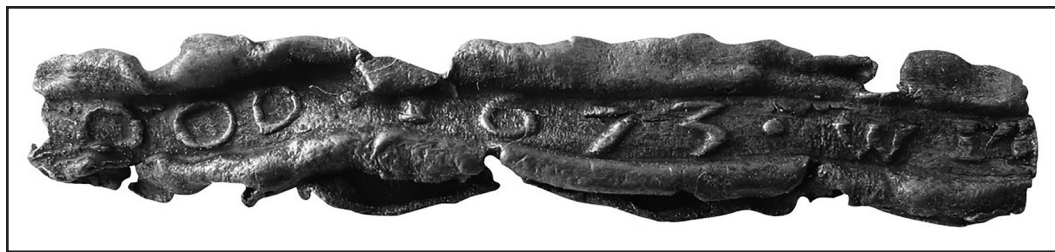
Figure 3. Mark of Francis Good, dated 1673, and associated with the initials WM.

information is Francis Good, who worked in the parish of All Hallows Barking in London near the Tower (Prerogative Court of Canterbury 1687). He is known archaeologically by two dated marks, one from 1661 and the other dated 1673 (Egan 2012: 294–295). The earlier mark has been found on five sites in the Chesapeake, while the later mark is known from only two sites. None of the marks associated with Good have been found in England. The first historical document that mentions Francis Good is the charter granted the London Glaziers' Company by James II in 1685/86, where Good is listed as one of 18 members of the court of assistants of the company (Ashdown 1918: 124). Good died in 1687 and, in his will, bequeathed property to his wife Letitia. The family is mentioned one more time in the daybook of the Company of Glaziers, where, on 29 October 1700, Letitia Good, widow of Francis, is recorded as taking an apprentice (Ashdown 1918: 70).