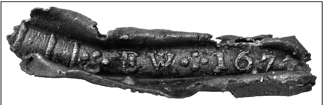
Figure 2. Mark lead with the initials EW and dating to the 1670s.

By looking at the glaziers whose names are fully included on the leads, it is possible to gain some insight on the question. The first of the 17th-century glaziers on which there is