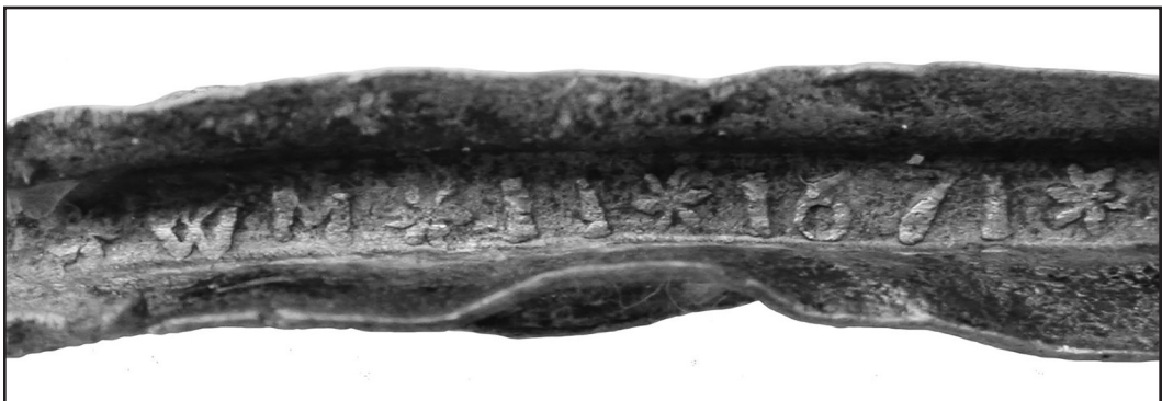
Figure 5. Marked window lead, dated 1671, from the Print House site.

Another interesting observation involves the leads marked with a date of 1689, which were the most numerous in the feature, and applies directly to the question of time lag. The window to which these leads belonged was made in England and shipped to St. Mary's City. The 1689 leads, at most, represented a time lag of five years, but probably less than that. Without looking at the context in which