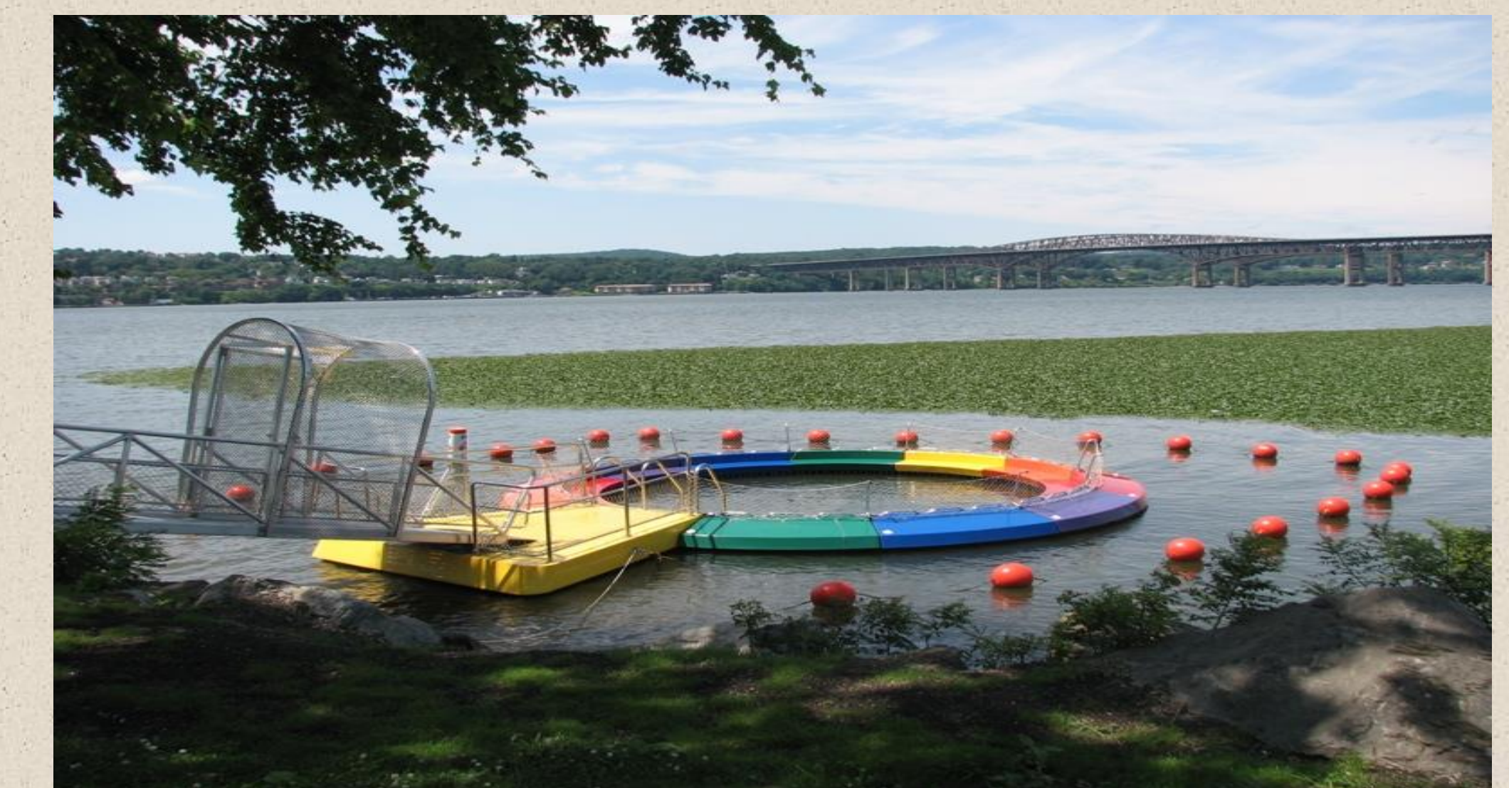
The Beacon River pool was created to connect the people of the Hudson Valley to the Hudson River. Pete Seeger believed that by connecting people with the water that they would take responsibility for keeping the river clean.

Goal: Connect Beacon to the waterfront as well as other communities along the Hudson River