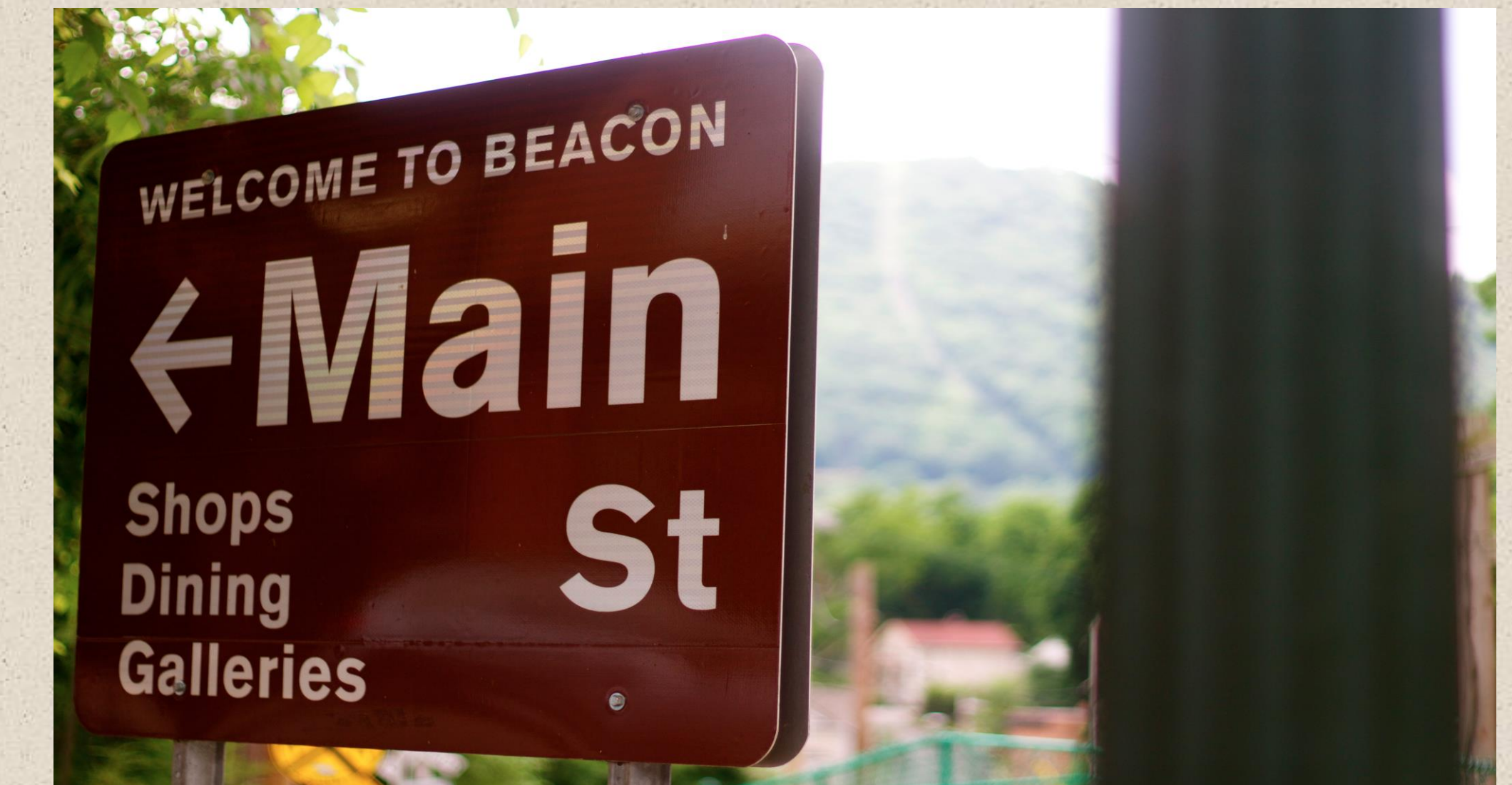
The City of Beacon has implemented maps and wayfinding signs within the City to help direct visitors to attractions. Now, the City of Beacon should focus their attention on signage outside the city that attracts visitors to the City of Beacon.

Goal: Promote attractions to those passing or driving through Beacon