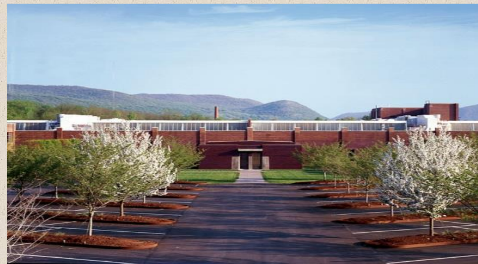
Dia:Beacon provides visitors with a sense of the past and the present cultures of the City of Beacon. The museum is located in an old Nabisco Factory near the Hudson River. Dia:Beacon is the largest contemporary art museum in the United States.

Goal: Incentivize regional visitors to increase tourism revenue in the Business District