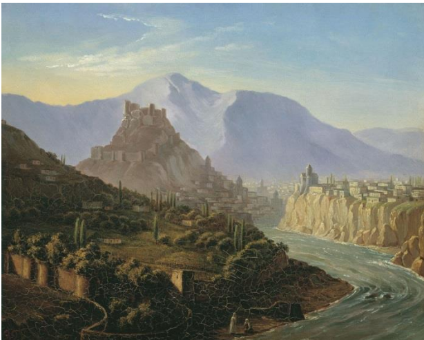
Mikhail Lermontov’s painting of Tbilisi, Georgia. The two people in the foreground are dwarfed by the sublimity of the mountains and the raging river. Painting by Mikhail Lermontov (1837).

Nearly every tree was enveloped from top to bottom with wild grape vines, and dark bramble bushes covered the ground thickly . . . The vigour of the growth in this forest, untrampled by cattle, struck Olenin at every turn, for he had never seen anything like it. This forest, the danger, the old man and his mysterious whispering, Maryanka and her virile upright bearing, and the mountains—all this seemed to him like a dream. (Tolstoy, 1961, p. 91)