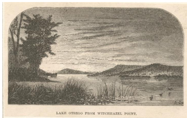
LAKE OTSEGO FROM WITCHHAZEL POINT. An illustration of Otsego Lake, on which Cooperstown rests.