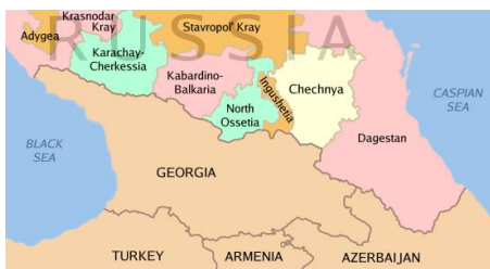
The modern political boundaries of the Caucasus along with the regions within the Russian Federation. Map by Kbh3rb (2005).

By the end of James Fenimore Cooper's childhood in the early 1800s, this natural abundance had been exploited by the Anglo-American townfolk. The forest disappeared and the fish became scarcer; the land had become civilized. The frontier-making process had transformed the natural environment of western New York, causing Cooper to adopt an ecocritical perspective in his famous series of frontier stories, The Leatherstocking Tales . Although Cooper was a champion of the frontiersman, those caught between Native American and European cultures, The Leatherstocking Tales took issue with the purely extractive nature of the frontier-making process (1985, p. 104).