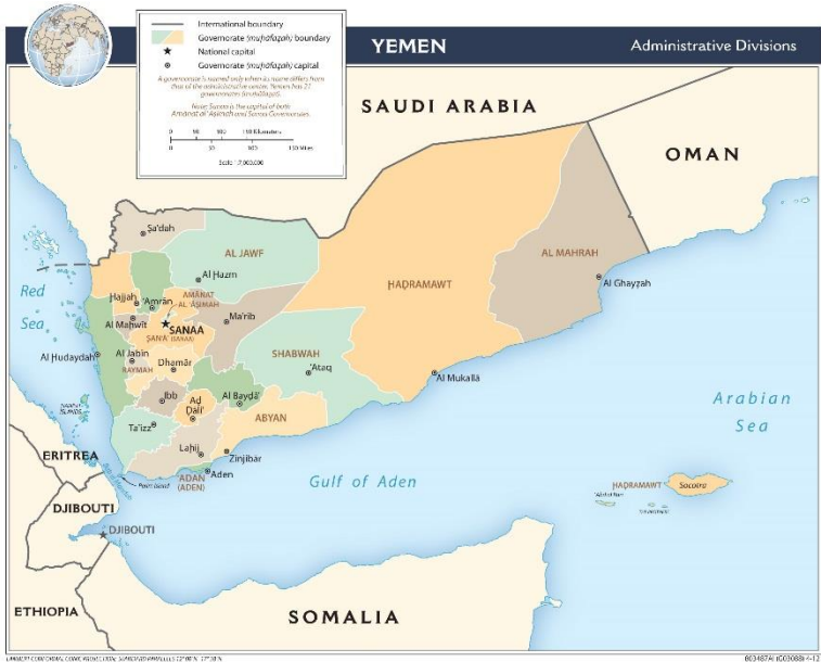
Map of Yemen and its administrative districts ( Map from CIA, 2012 ).

Even though I understood my research topic and responsibilities, I still had no idea what actual research looked like until I began my work. This should come as a surprise to no one, especially those in the humanities: it is a lot of reading. Instead of lab coats, rats, and goggles, this type of research requires several skills: finding accurate sources, reading carefully, drawing out interpretations, and synthesizing different sources of information into a coherent argument. Political science research can include interviews and primary document analysis, but for an early undergraduate like me, the focus was on synthesizing others’ research: sifting through ideas, facts, figures, and concepts from several works and disciplines, and then integrating my unique perspective to create an original analysis.