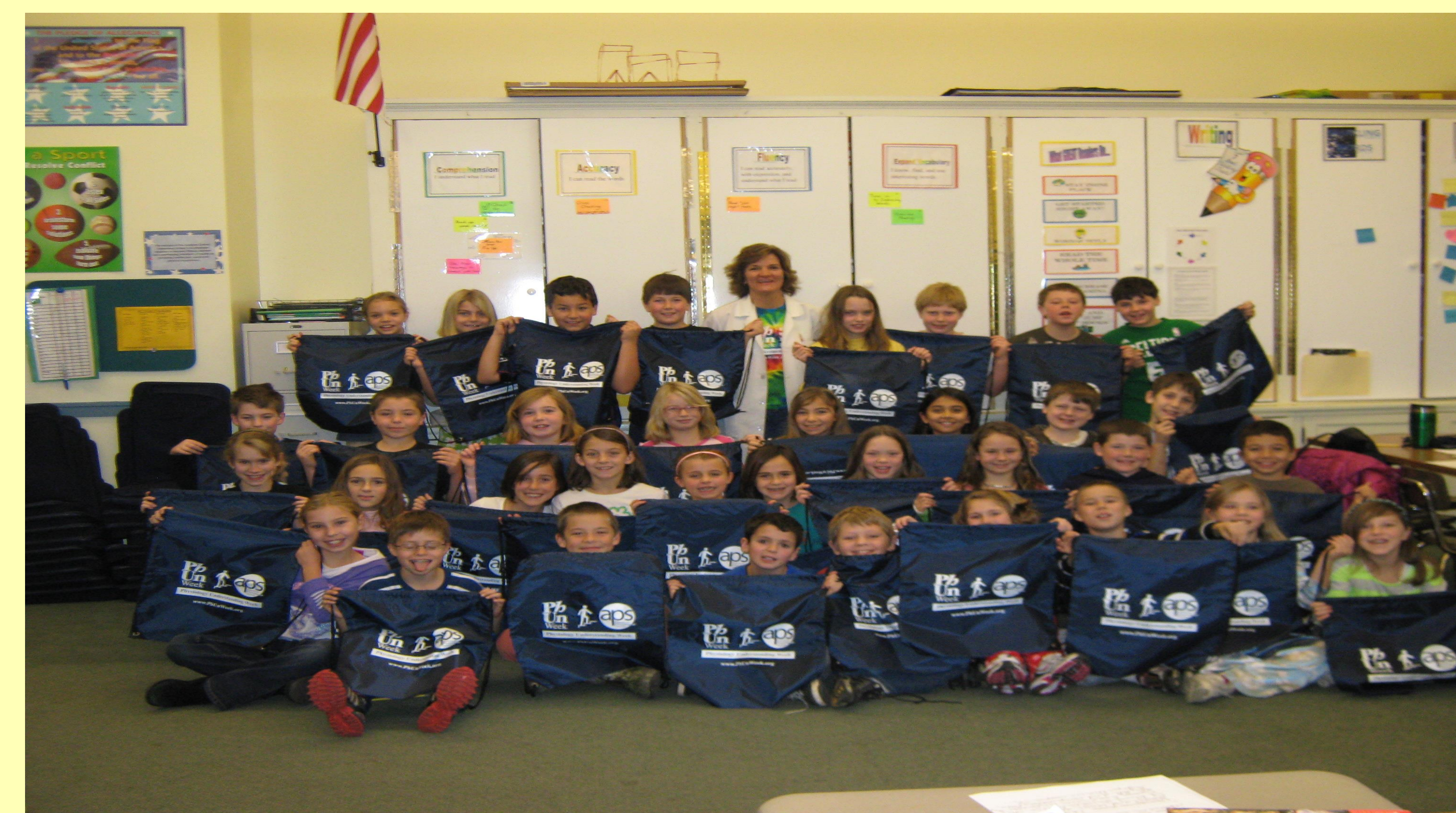
Very happy students after a PhUn week.

Post test provided some Qualitative data