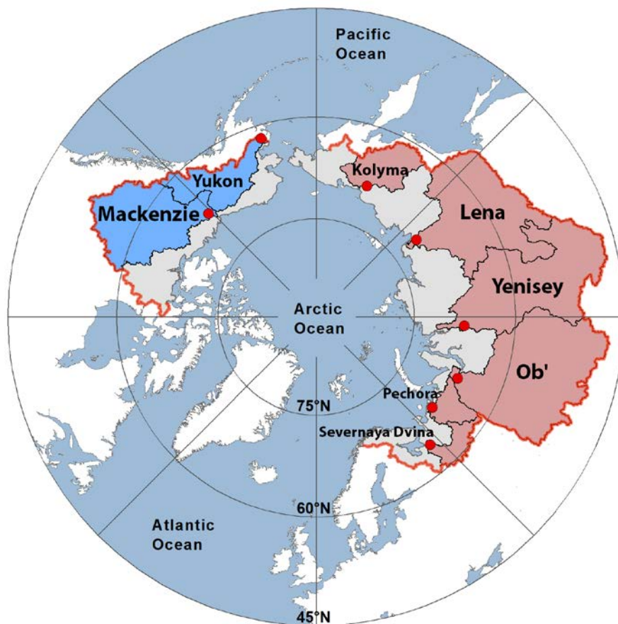
Fig. 8.1. Map showing the watersheds of the eight rivers featured in this report. Together they cover 70% of the 16.8 \times 10^6 km 2 pan-Arctic watershed. The red dots show the location of the discharge monitoring stations and the red line shows the boundary of the pan-Arctic watershed.

A long-term increase in Arctic river discharge has been well documented and is primarily a function of increasing precipitation linked to global warming (Peterson et al. 2002, McClelland et al. 2006, Shiklomanov and Lammers 2009, Overeem and Syvitski 2010, Rawlins et al. 2010). The long-term discharge trend is greatest for rivers of the Eurasian Arctic and constitutes the strongest evidence of intensification of the Arctic freshwater cycle (Rawlins et al. 2010).