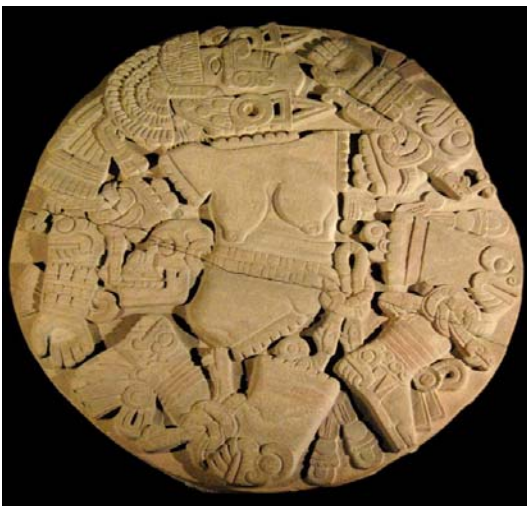
Figure 10. The Coyolxauhqui Disk found at the foot of the Templo Mayor in Tenochtitlan, depicting the goddess Coyolxauhqui in her dismembered state.

On the south side at the base of the Templo Mayor's staircase is the Coyolxauhqui Disk (Figure 10), a stone carved with the likeness of Huitzilopochtli's dismembered sister. That disk is situated on the site so that, once severed, the heads of sacrificial victims would tumble down the side of the pyramid and land atop this stone in a lifelike reenactment of the death of the goddess Coyolxauhqui at the hands of Huitzilopochtli. Opposite that, on the north side there is an altar dedicated to Tlaloc, which housed offerings of the bones of human children, including 42 skulls, covered masks, and funerary urns depicting the god Tlaloc, which were full of sea shells (Moctezuma 1985, 806). The dichotomy here is not in the type of offering, but in its presentation. Tlaloc's offerings are much less dramatic, being placed with reverence inside the altar dedicated to the god, while Huitzilopochtli's are much more showily presented to the public – head rolling down the south staircase to splash blood across the Coyolxauhqui Disk in a recreation of the myth of the god's birth. The Temple itself is a reflection of Aztec worldview: It is a sacred mountain Coatepec, birthplace of the Aztec patron deity Huitzilopochtli, bridging the gap between the earth and the heavens, the most central duality to the world of the Aztecs.