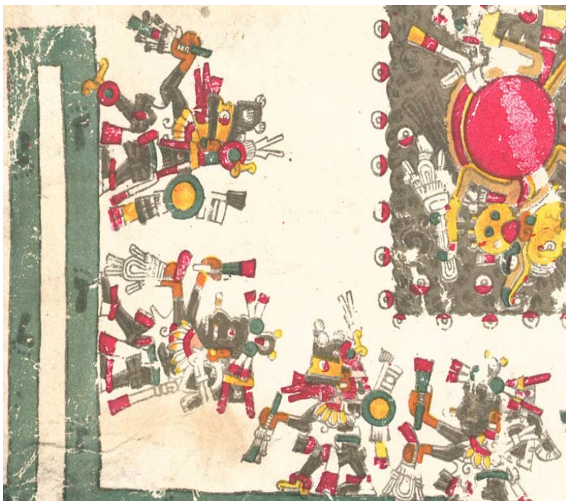
Figure 4. This shows a section of the upper left-hand corner Plate 35 in the Codex Borgia , depicting the taking of the sacred bundle to a shrine in the next plate by a pair of individuals. The individuals are moving along the blue road, signified by the footprints heading towards their destination. The leading figure is that of ‘Wind Mask’, who combines the attributes of Quetzalcoatl and Tezcatlipoca.

without the other, and neither can fulfill his divine duty without the action of the other. In having to work together, the twins can also be seen as two halves of a whole, similar to Quetzalcoatl and Xolotl (See Below). In the Codex Borgia , a Mesoamerican ritual manuscript, there is a figure repeatedly shown on Plates 35 and 36 who combines the attributes of both Tezcatlipoca and Ehecatl-Quetzalcoatl (Figures 4 and 5). The figure, referred to as ‘Wind Mask’ by Díaz and Rodgers (1993), has the facial coloring of Tezcatlipoca, the snout and jaw of Quetzalcoatl’s mask, the missing foot and back mirror of Tezcatlipoca, and the sacred bundle and conch shell pectoral associated with Quetzalcoatl. Thus, the individual known as Wind Mask appears to be a conflation of Tezcatlipoca and Quetzalcoatl, coming together to form a single, all powerful creator deity (Díaz and Rodgers 1993, 42-43).