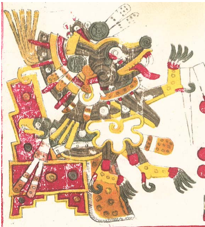
Figure 6. A portion from the upper section of Plate 65 of the Codex Borgia , depicting the seated entity Xolotl, as patron of one of trecentas , or groupings of 13 days, in the 260-day tonalpohualli , or Ritual Calendar. Both here and in his other depictions in the Codex Borgia , Xolotl is seen wearing Quetzalcoatl’s conch shell pectoral, a symbolic link, perhaps, between the two deities.

halves of a single whole. This idea is reinforced in iconographic depictions of Xolotl in the Codex Borgia (Figure 6), where he shares the conch shell pectoral ornament typically associated with Quetzalcoatl. In addition, the figure following ‘Wind Mask’ on Plate 35 of the Codex Borgia , (Figure 4) can be interpreted as a ‘Dark Quetzalcoatl’, again sharing the emblem of the conch shell pectoral. Thus, this depiction of Xolotl could be a more anthropomorphic version of Quetzalcoatl’s shadowy Nahualli. In addition, Xolotl is described in the Codex Borgia as the ‘God of Twins’ (Díaz and Rodgers 1993, XXIX-XXX), possibly alluding to his status as Quetzalcoatl’s Nahualli.