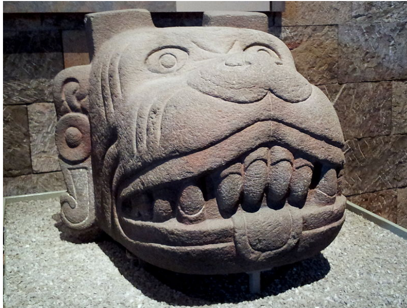
Figure 8. The Xolotl Head, excavated from the ruins of Tenochtitlan in Mexico City, showing Xolotl in his animal form, a dog (From en.wikipedia.org/wiki/Xolotl ). Another prominent example of the dark and light twins manifests in the deities Tezcatlipoca and Quetzalcoatl, respectively. Tezcatlipoca is the Lord of Darkness, the 'Sower of Discord', and he is associated with hunting and death, wandering about the world during the night, much like a jaguar, surprising night travelers (Minnecci 1999, 153). It is also Tezcatlipoca that is associated with sacrifice and blood, for his image is painted in murals on the sides of sacrificial altars, such as Altar A. at Tizatlan (Figure 9). While Tezcatlipoca is presented as the more destructive of the two, Quetzalcoatl is inseparable from his Dark Twin Tezcatlipoca; dark and light, order and violence, both are needed for creation to occur.