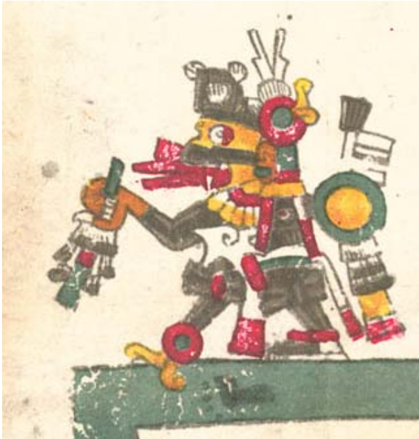
Figure 5. This is a closer image of the individual referred to in the Codex Borgia as ‘Wind Mask’, provided so as to clearly depict the merging of features associated with both Quetzalcoatl and Tezcatlipoca. Attributes of note include the mask associated with Quetzalcoatl, his conch shell pectoral in white, and the bundle, which is typically carried by the feathered serpent deity. In contrast, however, his painted face, back mirror, and severed foot all are reminiscent of depictions of Tezcatlipoca, Quetzalcoatl’s twin.