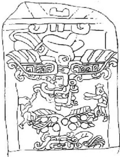
Figure 3. Stela 2 from the site of Izapa, depicting two individuals, interpreted here as being a representation of the Mayan Hero Twins Hunahpu and Xbalanque, on either side of a falling, winged figure. The middle entity is interpreted here as being that of Vucub Caquix, the monstrous bird vanquished by the Hero Twins in the Popul Vuh (from en.wikipedia.org/wiki/Izapa ).

Twenty-Five, also has a possible representation of Vucub Caquix perching in a tree with one of the Hero Twins standing beneath it. These two stelae, both from a Pre-Colombian site, predate most representations of the Hero Twins in Mesoamerica; this shows not only the symbol's vitality and timelessness, but also the early start to the pan-Mesoamerican idea of contrasting, yet complementary twins.