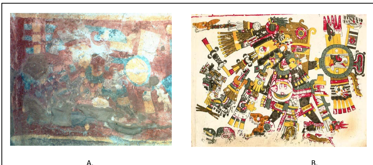
Figure 9. A Comparison of Tezcatlipoca Imagery from various sources; A. Mural on the side of Altar A at Tizatlan, clearly depicting Tezcatlipoca with his back mirror and headdress visible; B. Plate 17 from the Codex Borgia showing Tezcatlipoca for emphasis of similarity in features to the Altar mural.