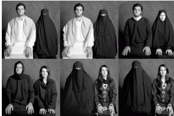
Figure 2: Hijab Series: What If... taken by Boushra Almutawakel

representation of the complexities of identity in Yemen. Class status, especially, removes