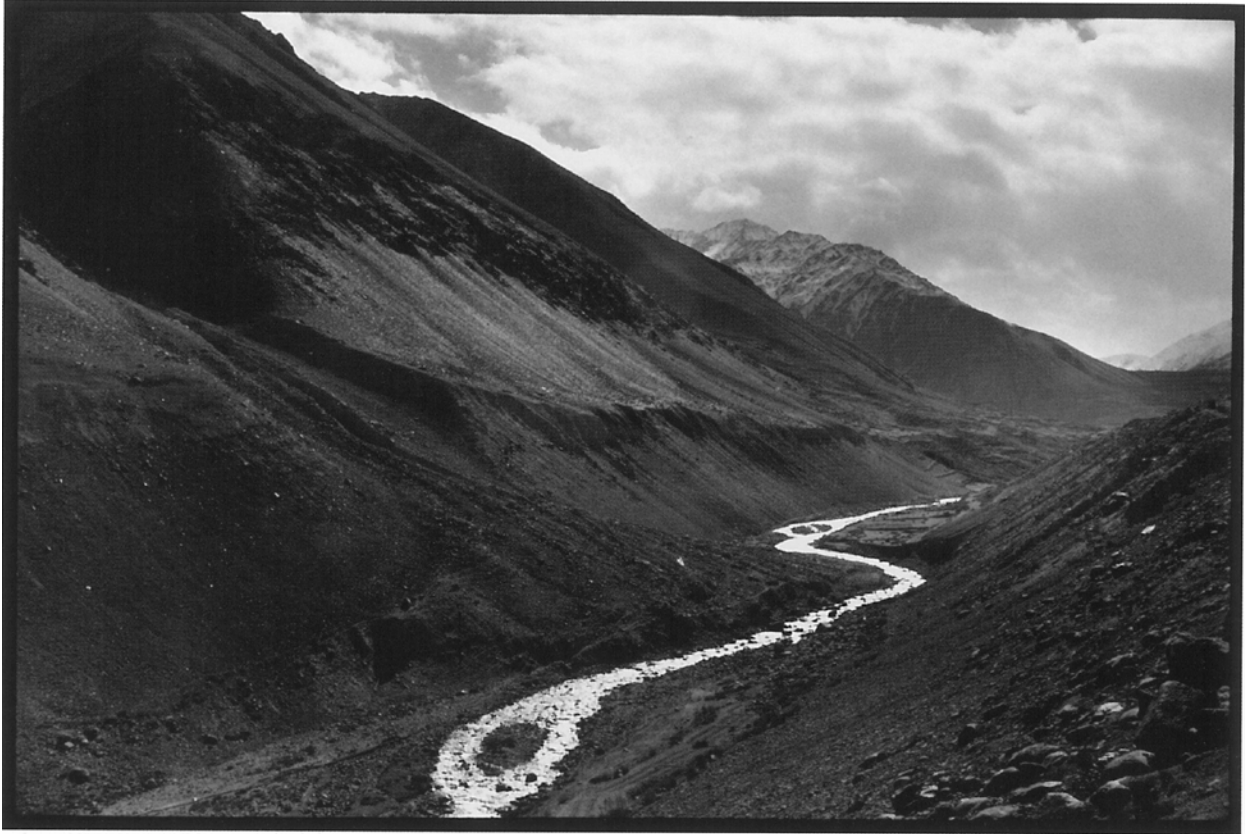
Figure 7: A vanishing point in the landscape. From The Photographer: Into War-Torn Afghanistan with Doctors Without Borders © 2009 by Emmanuel Guibert, p. 228. Reprinted by permission of First Second Books. All rights reserved.

The invitation to see the beautiful and the caveat that insists on necessary collaboration with the locals work together to counter the overwhelmingly demonic images of Afghanistan that proliferated after 9/11. While few Westerners ever needed or desired to conjure up the country in their imagination, the 2001 terrorist attacks on American soil and the subsequent U.S. invasions of Afghanistan and Iraq relied upon a grainy image of a bearded, white-robed Osama Bin Laden as the defining cultural image by which we (Western teachers and students) imagined Middle Eastern men we deemed terrorists from a place to which most Americans rarely needed to pay attention. Documenting pre-9/11 events but published following the tragedy, The Photographer now offers a competing view and speaks to the non-Taliban humans at the heart of MSF's missions. According to Lan Dong, the text challenges her students' "preconceptions ... well beyond what the media have been reporting on: Taliban and extremists" (226). Lefèvre's focus on humanitarianism re-imagines Afghans for us – offers us a visual image other than that of Osama bin Laden – while Didier is irrevocably changed from his travels, not only and unfortunately physically, but more importantly psychically.