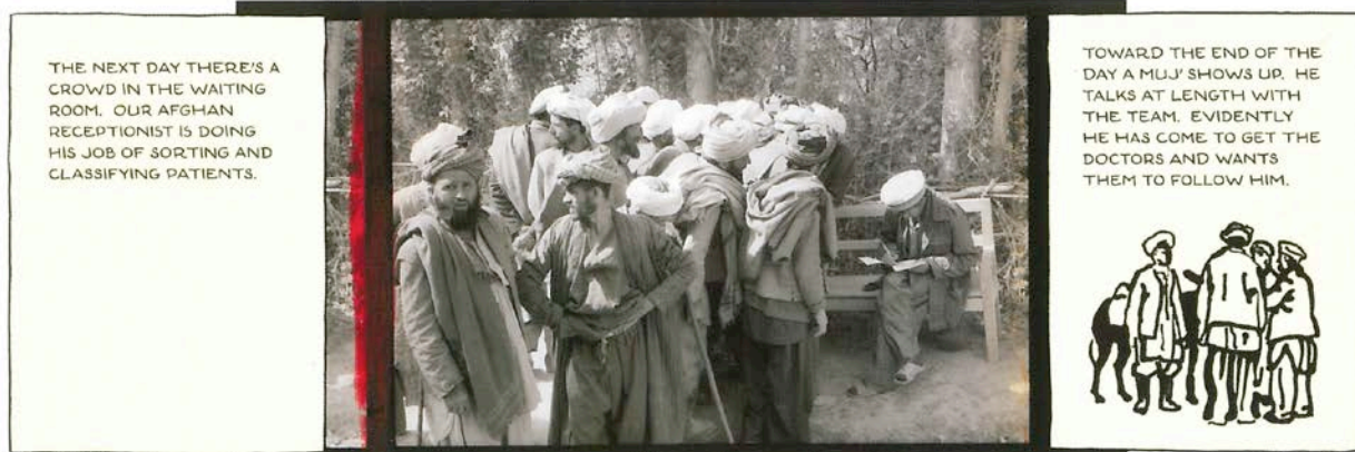
Figure 6: Photographs juxtaposed against graphic images. From The Photographer: Into War-Torn Afghanistan with Doctors Without Borders © 2009 by Emmanuel Guibert, p. 109. Reprinted by permission of First Second Books. All rights reserved.

The Photographer's cartoonist Guibert says himself that his comics were "to overcome the gaps between the photographs and to relate what happened when Didier .... was unable to take photographs" (quoted in Nancy Pedri n.p.). 15 The so-called "realist" photos cannot speak for themselves, according to Pedri, announcing the necessity for words and images to work together as "equal partners" (n.p.)