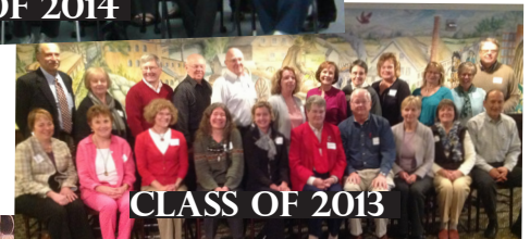
CLASS OF 2013