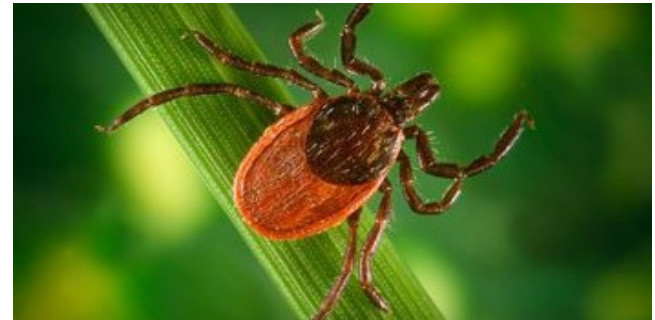
Ticks can attach to any part of the body but are often found in hard-to-see areas. In most cases, the infected tick must be attached for 36-48 hours before it transmits Lyme disease.

Concerns about a tick bite should be discussed with a healthcare provider.