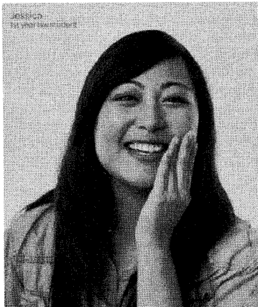
First request for free legal advice. #Family #BeUnprecedented

Nor are offline tagmark uses, such as those reflected in LexisNexis's specimens for its #BeUnprecedented 251 registrations, necessarily immune to the use problem. One specimen comprises six images of law students with captions designed to mirror social media statuses, such as "First one called on in Civ Pro. #SocraticMethod #BeUnprecedented" and "First request for free legal advice. #Family #BeUnprecedented." 252 When offline uses simply mirror online ones,