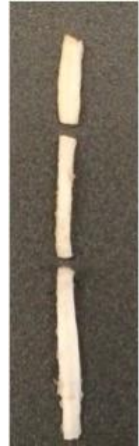
Figure 2: Image of a dissected mouse spinal cord. From top to bottom the sections are cervical, thoracic, and lumbar.

The neuronal cell bodies in the trigeminal nucleus are responsible for the perception of pain from the neck and head (Wilcox et al., 2015). The caudal (lower) portion of the trigeminal nucleus contains a cluster of cells known as the spinal nucleus of the trigeminal nerve. This cluster of cells is responsible for the transmission of painful signals, as opposed to other sensory information (such as touch and pressure) that is also carried through the trigeminal nucleus (Wilcox et al., 2015).