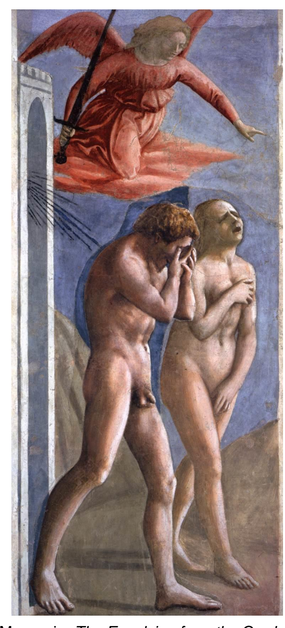
Figure 20, Masaccio, The Expulsion from the Garden of Eden, 1425, Fresco