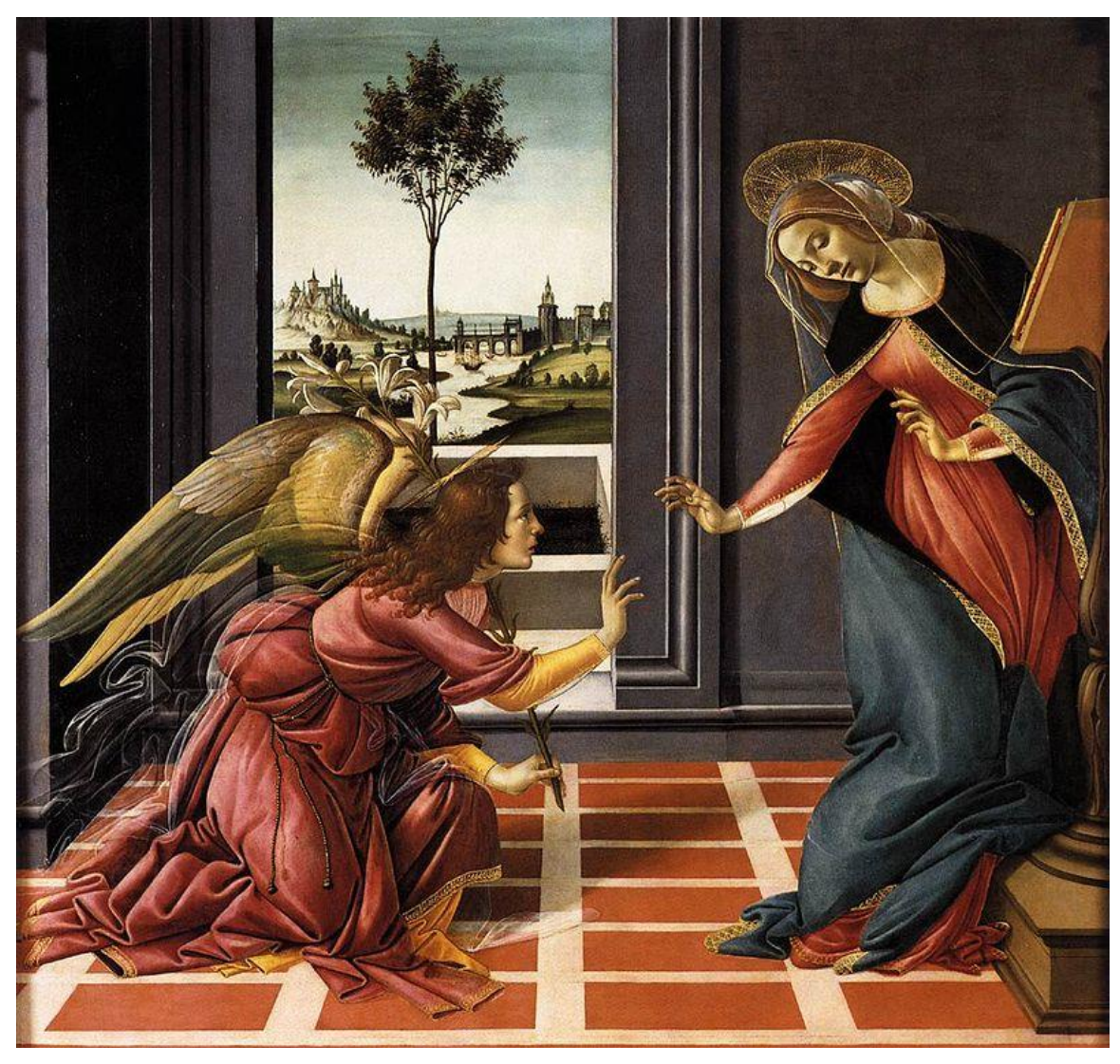
Figure 17, Sandro Boticelli, Cestello Annunciation, 1489, Tempera on Panel, 59" x 61"