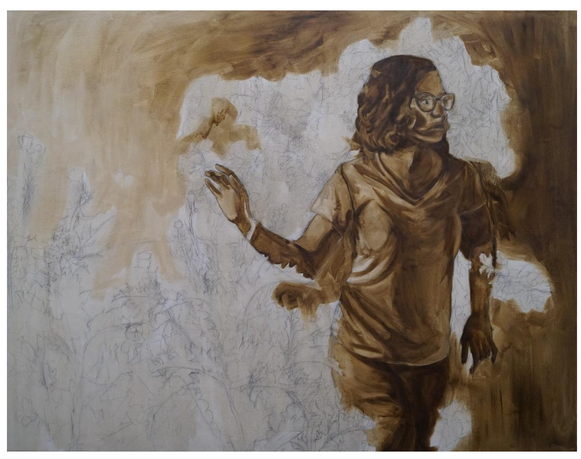
Figure 1, Underpainting for Metanoia, A Turning , 2018, Oil on Canvas, 52" x 66.5"