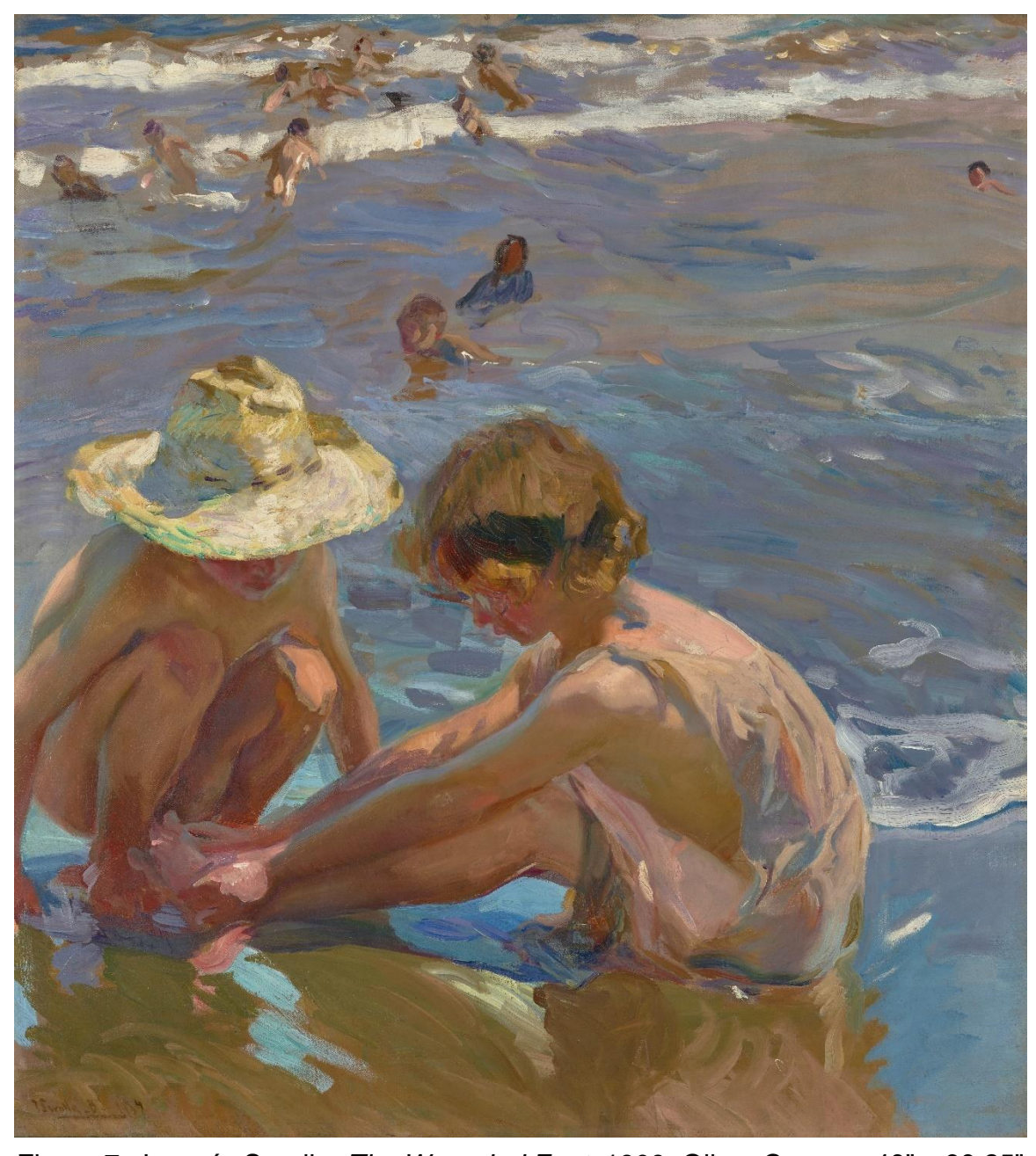
Figure 7, Joaquín Sorolla, The Wounded Foot , 1909, Oil on Canvas, 43" x 39.25"