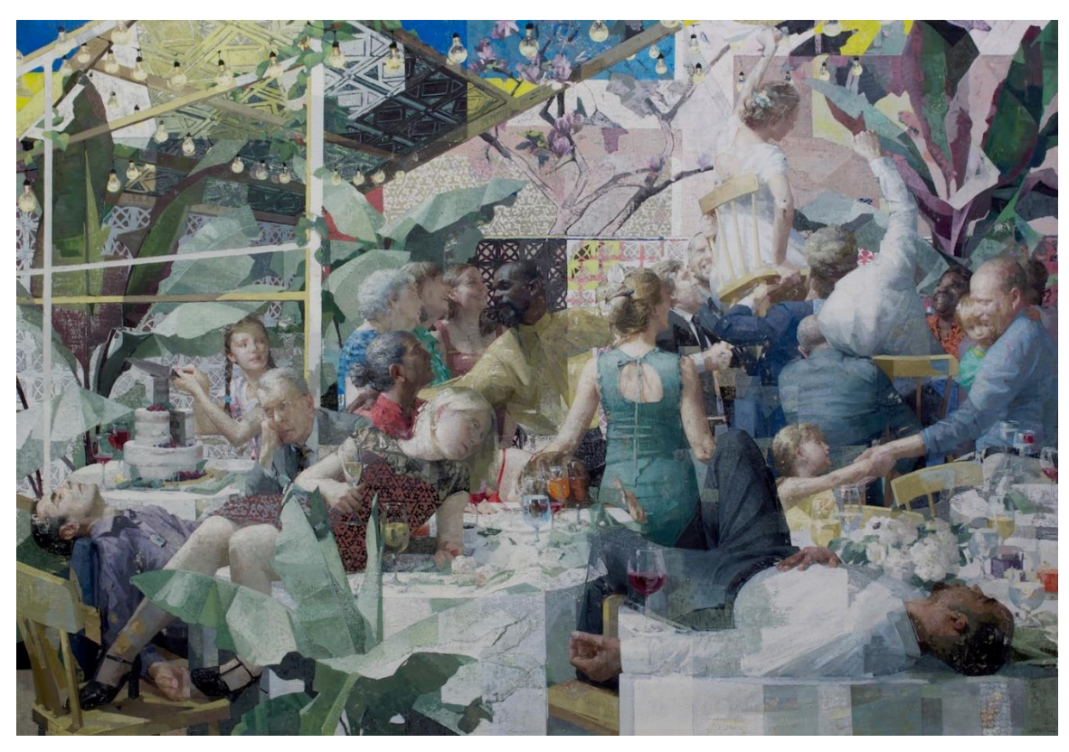
Figure 13, Zoey Frank, Wedding, 2018, Oil on Canvas, 96" x 140"