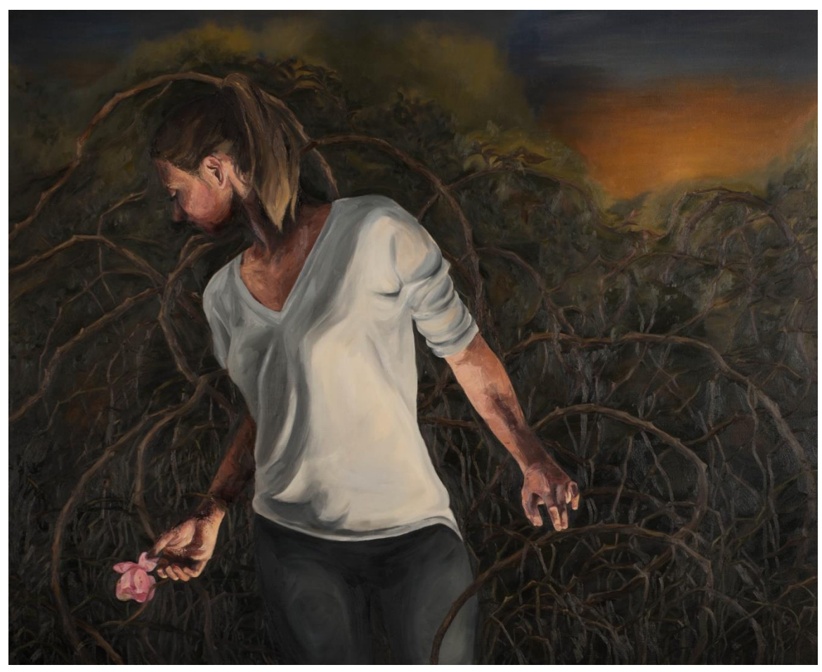
Figure 22, Nothing Like Eden, 2019, Oil on Canvas, 55" x 68"