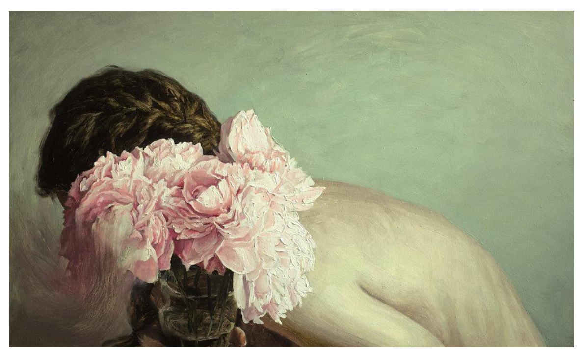
Figure 12, Helene Delmaire, Still Life with Flowers VI, 2016, Oil on Canvas, 50 \times 30 \text{ cm}