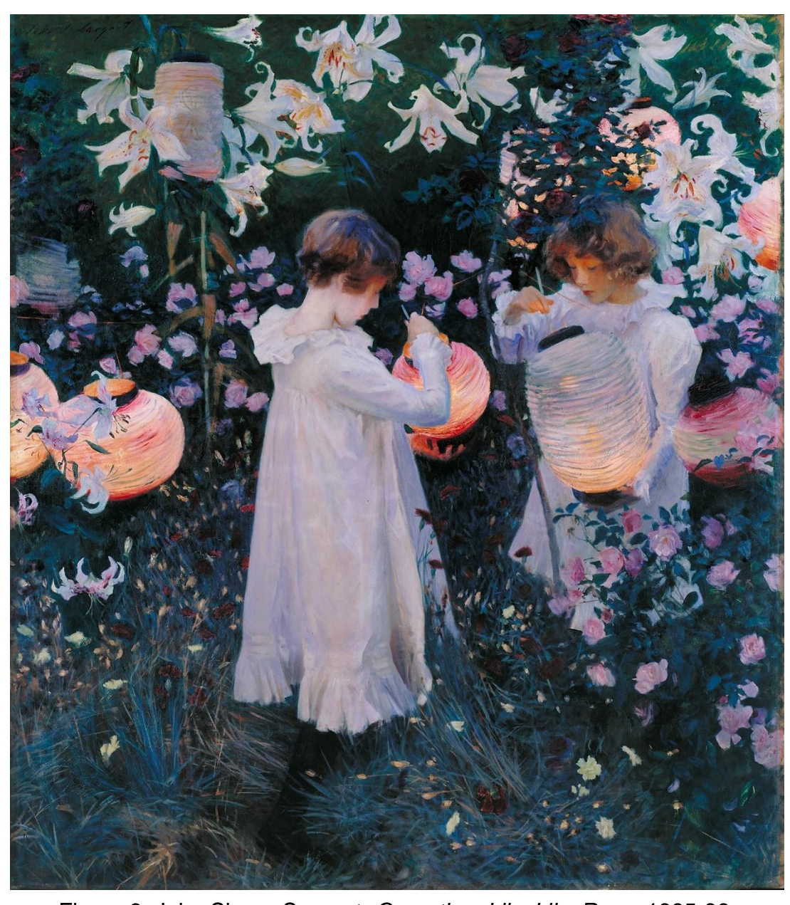
Figure 6, John Singer Sargent, Carnation, Lily, Lily, Rose, 1885-86, Oil on Canvas, 5' 9" x 5' 1"