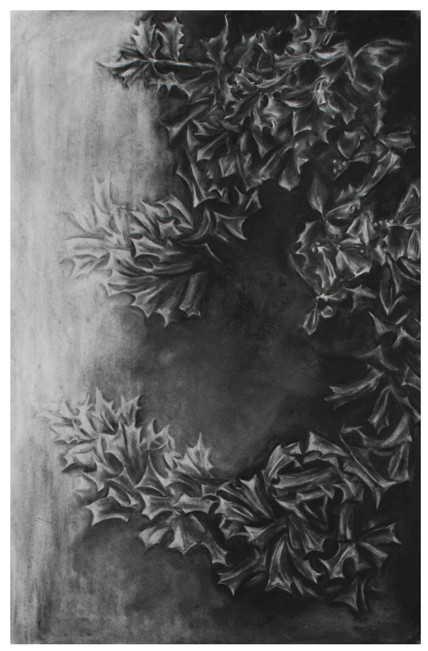
Figure 4, Into the Light, 2019, Charcoal on Paper, 26" x 40"