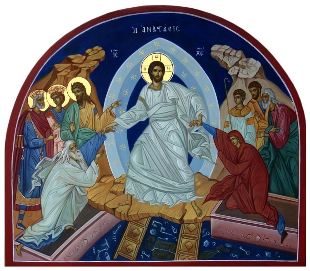
Figure 18, Christ's Descent Into Hades, Tempera on Panel