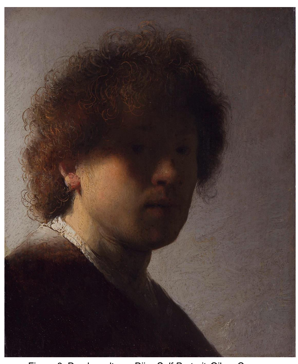
Figure 8, Rembrandt van Rijn, Self Portrait , Oil on Canvas, 22.6 x 18.7 cm