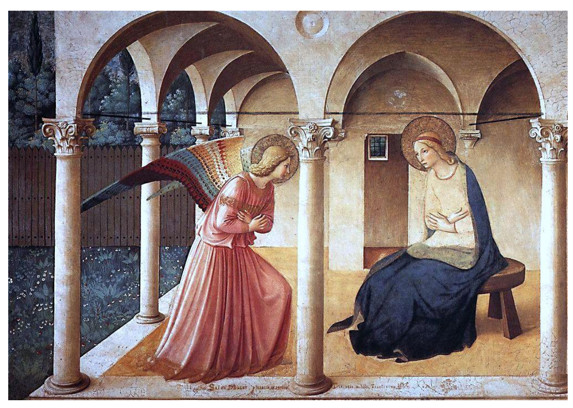
Figure 19, Fra Angelico, The Annunciation, 1437-46, Fresco