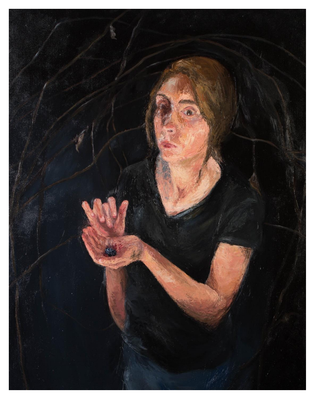
Figure 10, Every Common Bush , 2018, Oil on Canvas, 32.5" x 42.25"