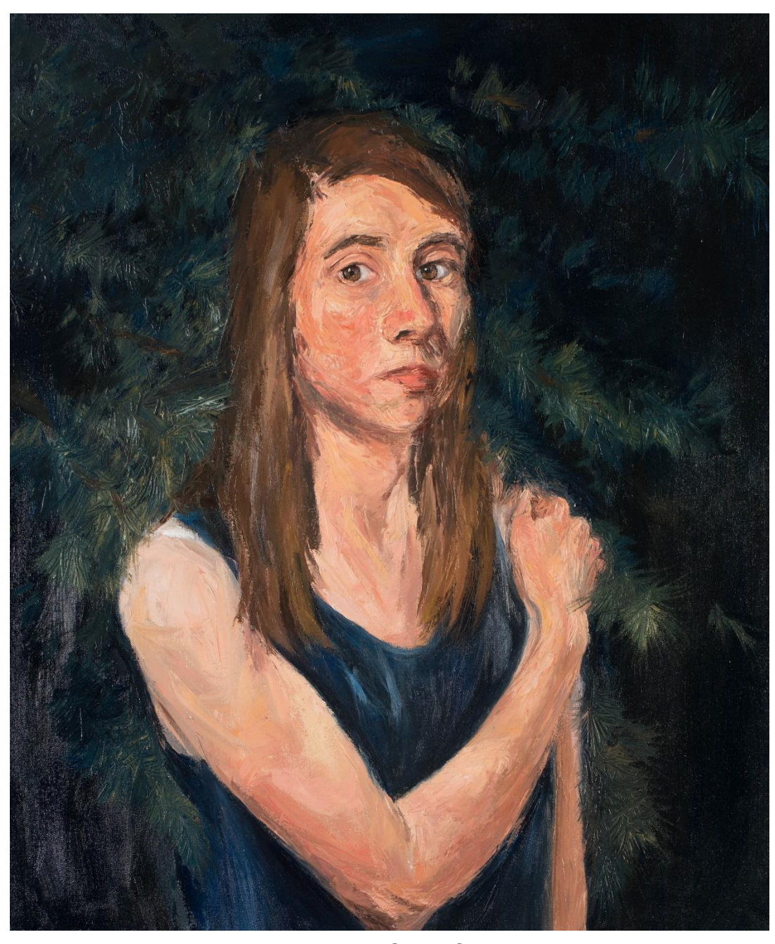
Figure 16, Evergreen, 2018, Oil on Canvas, 27.25" x 32.5"