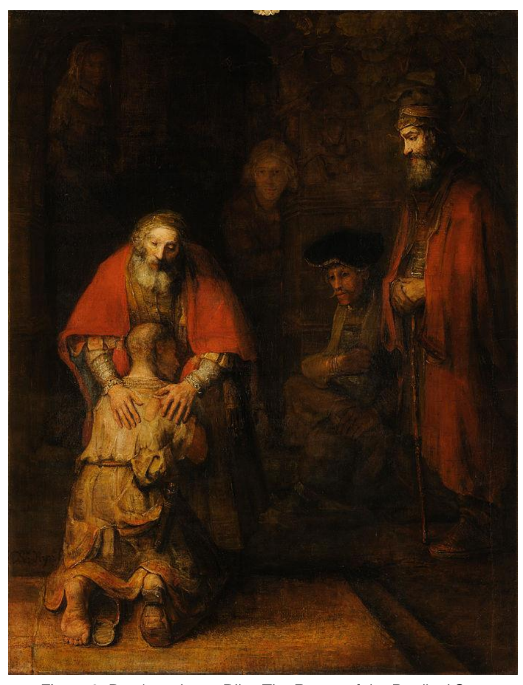
Figure 9, Rembrandt van Rijn, The Return of the Prodigal Son, 1663-69, Oil on Canvas, 262 x 205 cm