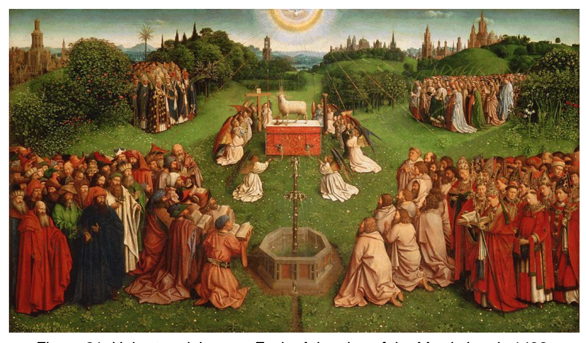
Figure 21, Hubert and Jan van Eyck, Adoration of the Mystic Lamb , 1432, Oil on Panel, From the Ghent Altarpiece