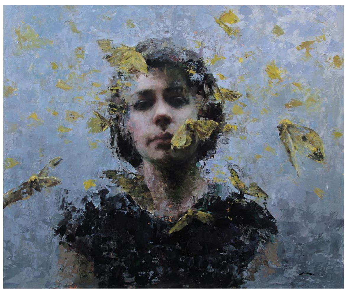
Figure 15, Mia Bergeron, Evensong , 2015, Oil on Panel, 20" x 24"