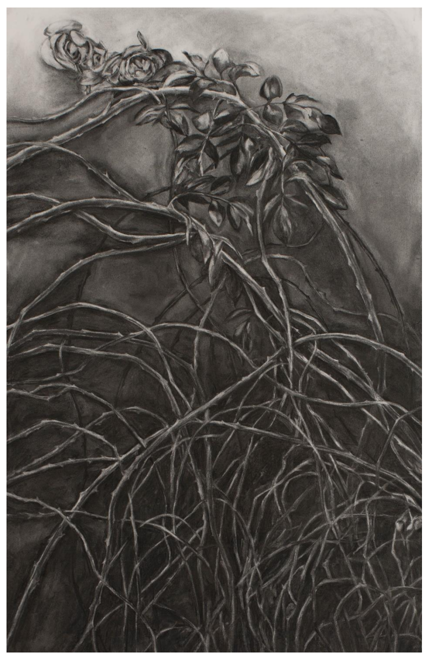
Figure 5, Entangled, 2019, Charcoal on Paper, 26" x 40"