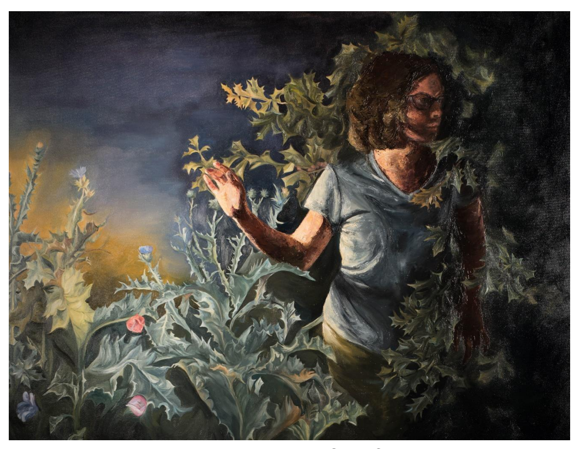
Figure 3, Metanoia, A Turning, 2019, Oil on Canvas, 52" x 66.5"