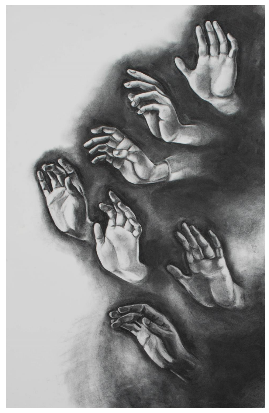
Figure 2, Annunciation Hands , 2019, Charcoal on Paper, 26" x 40"