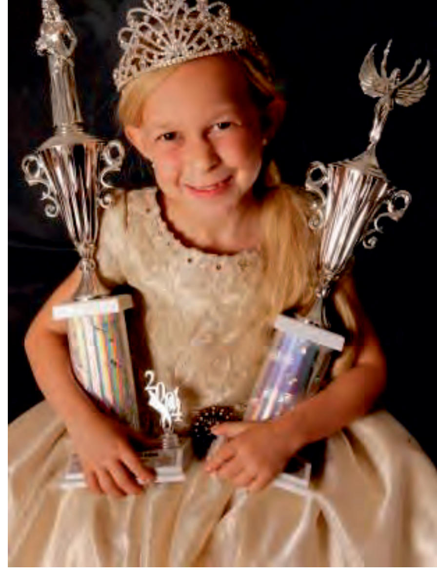
Retrieved from https://www.thejournal.ie/childrens-right groups-concerned-by-child-beauty-pageant-set-for-irelan