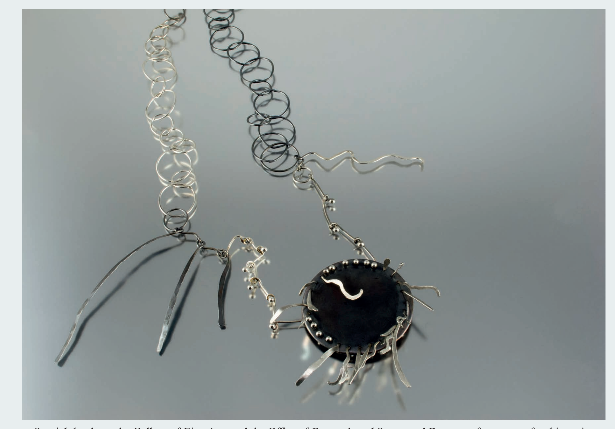
Special thanks to the College of Fine Arts and the Office of Research and Sponsored Programs for support for this project.

Each, week I would submit the works to my professor. After completing the 5 projects, I received the works again and had a week to edit and finish each work. The conclusion of this endeavor, was a group critique including professors and two cohorts that also completed the same trial. Critiques are significant for artists in order to critically evaluate the previous works to plan for future works. Upon completion, I practiced professional photographic documentation techniques and reflected upon my body of work in order to find a pattern or core concept.