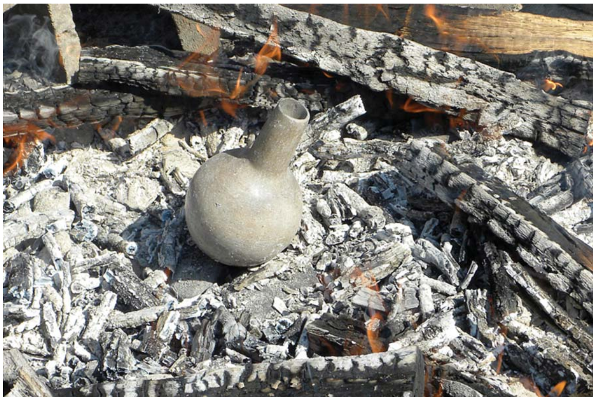
Figure 9. Pit Fire of “Nidahhih Hakaayu” (White River) bottle.