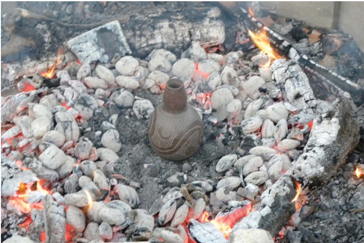
Figure 8. Pit Fire of “Hadiku” (Black) bottle.