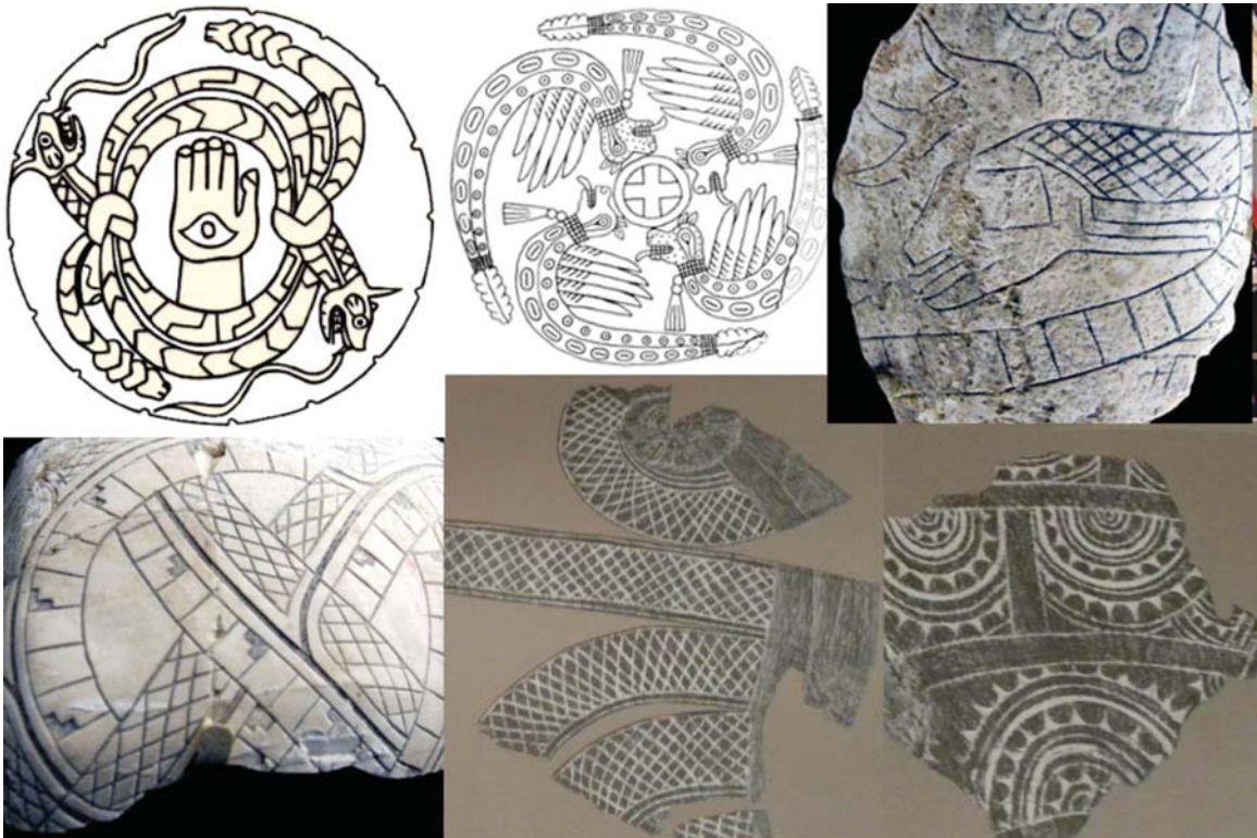
Figure 13. Representational to iconic designs.