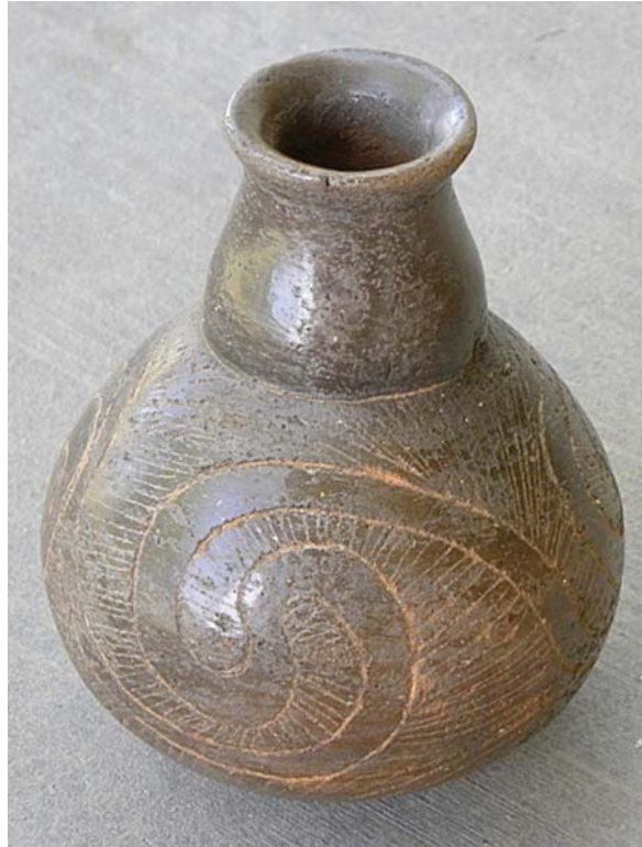
Figure 12. Fired Pot “Hakunu” (Brown).