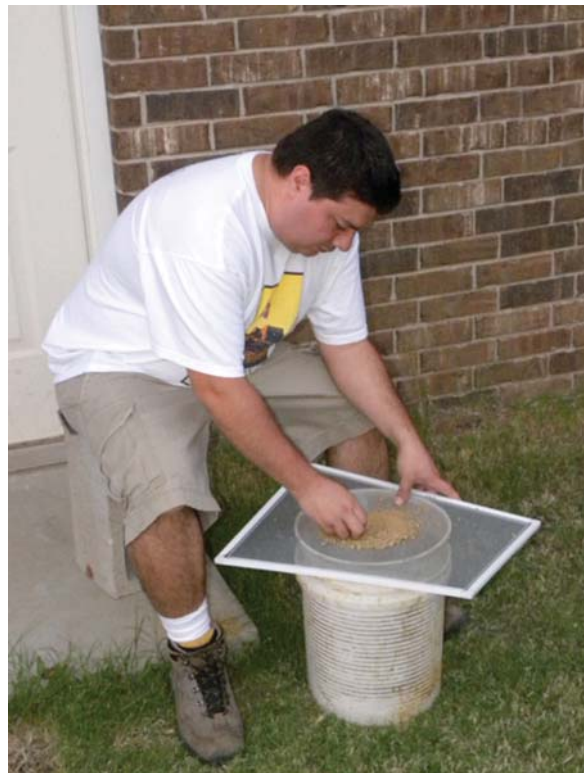
Figure 5. Hand Processing Clay.