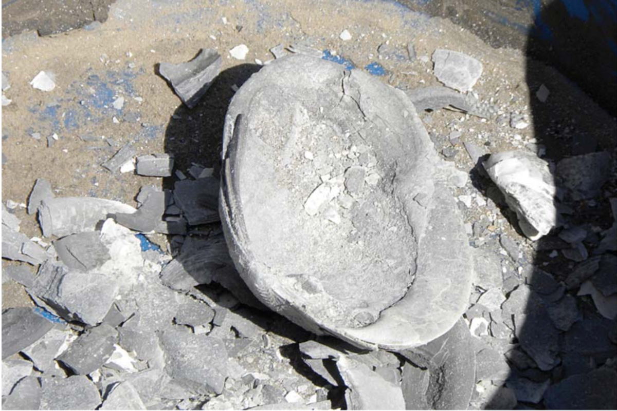
Figure 7. Crushed Mussel Shell.