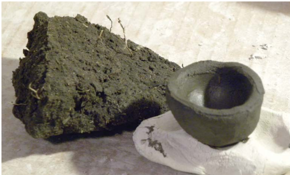
Figure 3. Local raw clay.

I feel like it is then my responsibility to learn and understand what is inherently traditional about my tribe's arts, promote it, and represent it to the best of my abilities. It should also be marketed and described correctly and as accurately as possible. Upon my acceptance as a Native American artists or as a Caddo potter I feel like it is then my duty to take these responsibilities seriously as I am afforded the benefits of being a Caddo representative and a Native American and not merely an independent fine artists with no guidelines that describe and define my people's heritage and culture. I am setting an example for all of my Caddo people then and not just of myself. Because of that, I feel like I should be true to myself and to my people and to the public about what is traditional and what is contemporary of the Caddo Nation. With this in mind, I set out to learn as much as I could. It was almost as a feverishly obsessive quest that I leaped into discovering everything that was known about the Caddo's prehistory as it pertained to pottery, the designs and their meanings, the substance of the clay, and the tried and true methods of finishing and firing. Although I have read over 100 books now that pertain to the Caddo, Southeast Indians, pottery, and ceramic techniques, it