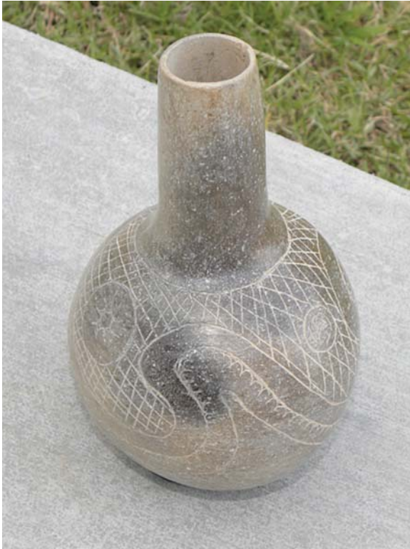
Figure 11. Fired Pot “Nidahhih Hikaayu” (White River).