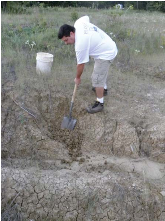
Figure 4. Digging Clay.

While I did immediately start using commercially produced clays because that is what I had readily available to me, I finally did start using traditional clays, but not necessarily local clays all of the time (Figure 3). The Caddos would find and use what was the easiest and best quality clay around them rather than carry it for miles. However, I did want to use the clays our ancient ancestors used that were from the same rivers and oxbows. With a little help I was able to collect some clay in and around the Red River and the White River of Arkansas. I also experimented with shoveling up the various types of clays from my property and processing them like my ancient ancestors (Figures 4-5). My property's clay is like a sticky silty gumbo buckshot. It is black, full of silt, and I have to screen out small particles of manganese and limestone. I have found bone and pyrite in it too. However, this extremely silty clay has a tendency to want to crack in the fire. In my research I was able to talk to an Arkansas archaeologist named John Miller (Figure 6), who confirmed what I had suspected. The clay needed a temper that would help with the shrinkage and dehydration in the stress of firing. Traditionally we had used crushed bone and fired clay (grog), but that eventually evolved into the use of crushed mussel shell.