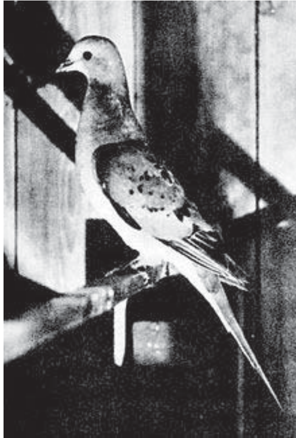
Figure 2. Early 20th century photograph of a passenger pigeon.

two burials. Passenger pigeon remains extend below the ceramic-bearing deposits into non-ceramic strata. In total, 135 elements, representing 19 minimum individuals, were recovered from Saltpeter Cave. Finally, a single passenger pigeon bone has been recovered in a refuse pit at the Poverty Point site in Northeast Louisiana ( http://www.passengerpigeon.org/states/Louisiana.html ), and at the famous Mississippian site of Cahokia in southern Illinois (Parmalee 1957).