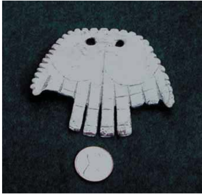
Figure 5. Engraved shell gorget or pendant from 3GR8, Grant County Museum Collection (AAS/HSU slide 1092).