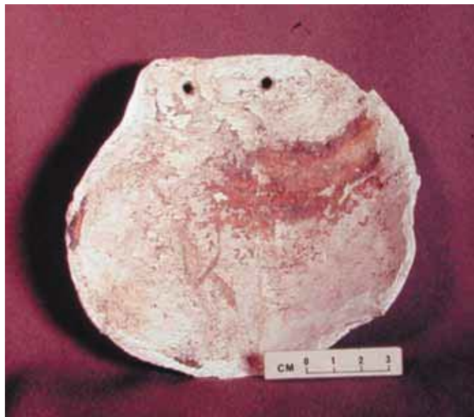
Figure 4. Plain shell gorget from Moore site, Furr Collection (AAS/HSU slide 1333).

In addition to these two gorgets, there are two others that are known from AAS/HSU station photographic records but are not curated by the Survey. A plain shell gorget was photographed in 1974 by Ann Early during documentation of local amateur Hoy Furr's collection (Figure 4). This gorget reportedly came from a burial at the Moore Mound site (3CL56). Moore, like Bayou Sel, lies on the Ouachita River. Part of one mound remains today where there were once three mounds and associated cemetery and residential areas. While no professional archeological excavations have taken place, artifacts noted from the site indicate a Mid-Ouachita to Social Hill phase occupation (A.D. 1400-1650). The marine shell artifact illustrated has an irregular circular shape with some breakage around the edges, and has two drilled suspension holes. There is no visible engraving or decoration. According to notes provided by Furr, this gorget was found in a child's grave that had been dug by Furr and Gene Hudnall in "House site #3" at Moore in 1974.