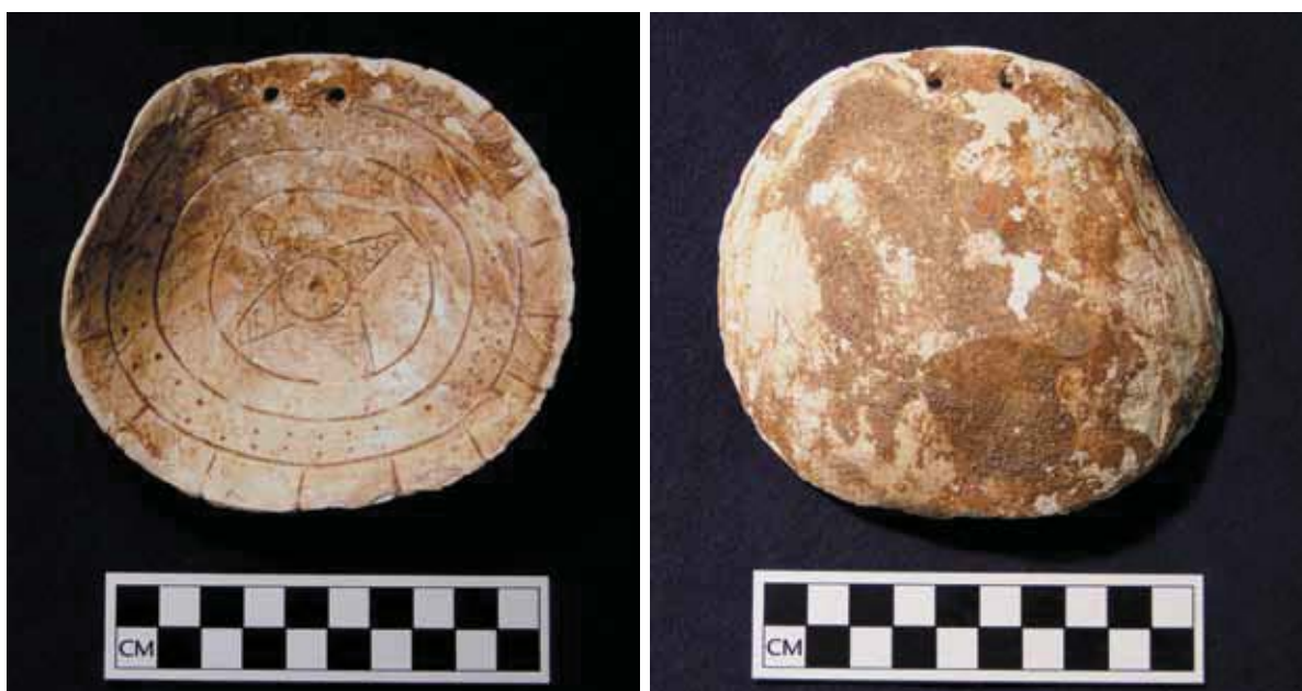
Figure 3. Engraved shell gorget from Shepherd (AAS/HSU D_K1119 and 1122, 74-249, 3CL39).