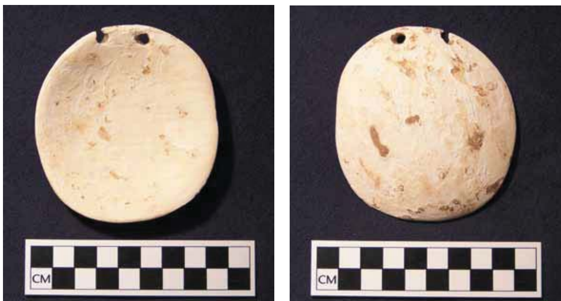
Figure 2. Plain shell gorget from Bayou Sel (AAS/HSU D_K1113 and 1116, 74-248, 3CL27).