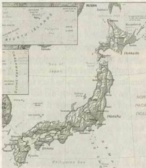
Lower circle Ie Shima