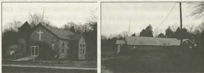
Figure 4: Old Bethel Baptist Church and New Bethel Baptist Church (S. Loftus 2014)

community slowly acquired brick for the façade from a local kiln in Athens as funds became available, and how people gathered on weekends to build the façade as well as a concrete wheel-chair ramp that leads to the front door (Johnson 2013).