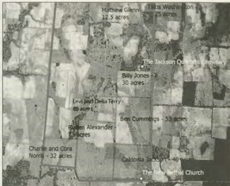
Figure 2: 1933 Aerial showing parcels of land on the Benjamin Jackson plantation sold by the Jackson brothers to African Americans during the early-twentieth century (Drawing by S. Loftus, 1933 Tobin Aerial Photograph, Anderson County Deed Records)

This included the persistence and determination of the local black population to secure land in order to successfully establish community and infrastructure over generations, changes in social attitudes among the next generation of the Jackson family, a decrease in the land value of the sandy soils in this area which had suffered from cotton production, as well as, the movement of former plantation owning families into new business ventures in urban areas. In the following section land transactions that took place during the years 1914 – 1935 between Benjamin Jackson's sons and the local black community are considered (Figure 2). These negotiations, which are primarily evidenced through deed of sale records available at the Anderson County Courthouse, serve as a means to demonstrate the transformation and mediation of the landscape in relation to property ownership and control.