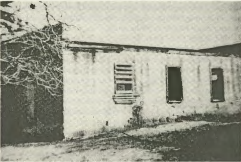
St. Stevens Chapel ca. 1960s