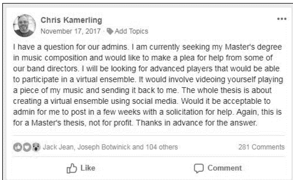
Figure 12: Initial Facebook Post

I explained that participants would have to video themselves playing a piece that I had written and submit it to me via Dropbox to be combined with others' videos to make a product. I told them it would be like Whitacre's Virtual