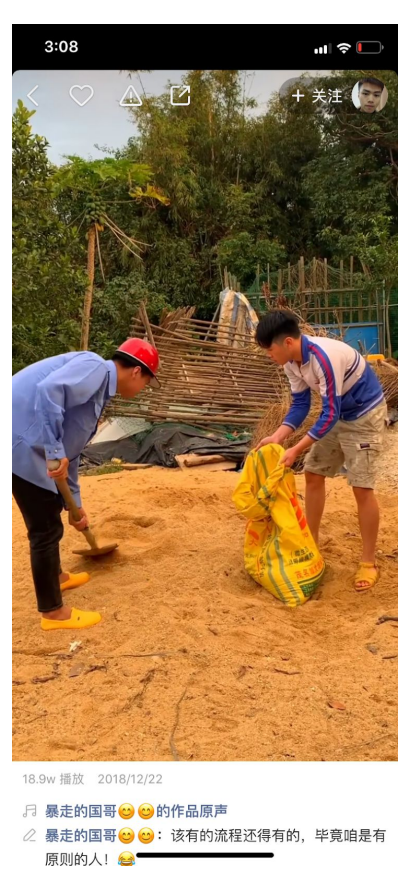
Fig. 6 Screenshot of a Kwai user, 2019