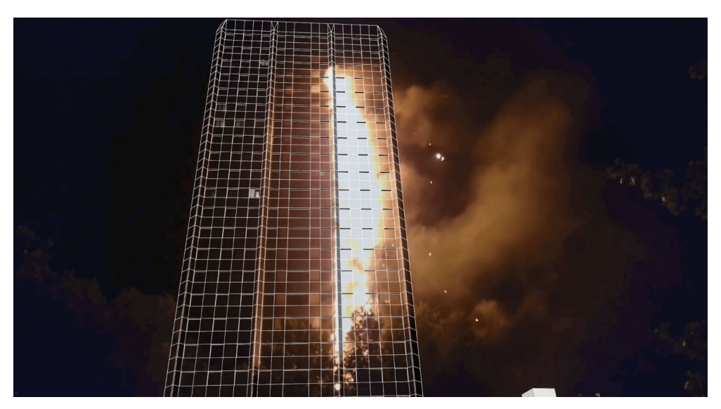
Fig. 21 Forensic Architecture, Video footage of the fire is 'motion tracked', and mapped onto a wire-frame model of Grenfell Tower, 2018