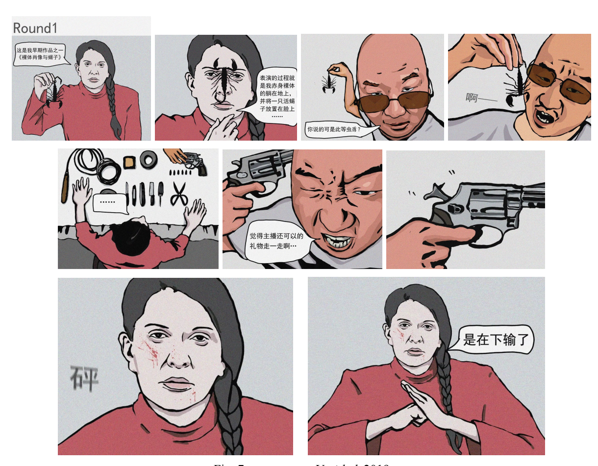
Fig. 7 anonymous, Untitled, 2019

of Marina Abramovic's performance is actually controllable, but that the Kwai users' performances are more authentic and impactful. In another short online article titled What Makes Him Become Bill Viola , the author compares a Kwai video produced by Brother Bao (or "Baoge") to Bill Viola's The Crossing and The Reflecting Pool , arguing that Brother Bao's usage of lo-fi mobile phone visual effects have their own intrinsic artistic value - the poetry of poor quality - which is equivalent to the poetry of Viola's work (see fig. 8,9,10,11).<sup>12</sup>