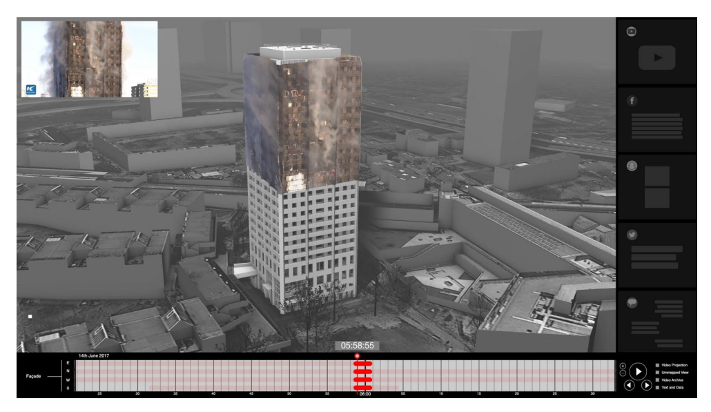
Fig. 20 Forensic Architecture, The Grenfell Tower Fire, 2018

in London (Figure 20, 21). The work consists of 3D modelling, situated testimony, and software development technology.<sup>23</sup> These three sources generate a conflicting feeling when brought together. The combination of the open-source elements in Forensic Architecture's works offers an overwhelmingly multisource and multi-perspective reading experience of a horrific incident and creates a new phenomenon of storytelling. Their approach gave me a new perspective of thinking about using open-source elements in the practice of parallel narrative.