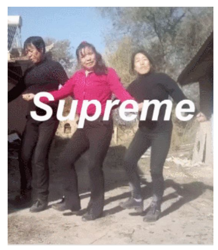
Fig. 12 Social swing Dancing