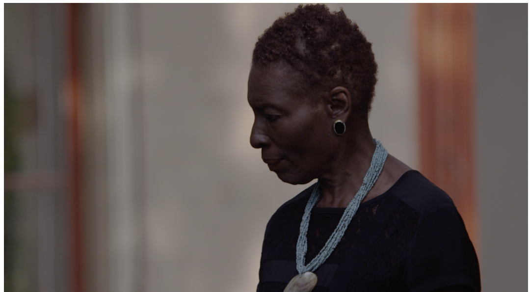
Fig. 15 Arthur Jafa, love is the Message, The Message is Death, 2016

Arthur Jafa's work, love is the Message, The Message is Death (Figure 15), mixes different sources of found footage - some violent, depicting the lived experiences of many African Americans in the US today. The video soundtrack is a slowed-down version of Kanye West's song Ultralight Beam , a powerful rap with strong beats. When talking about this work, Jafa said that: "with black visual intonation, it was really possible to create moving image phenomena