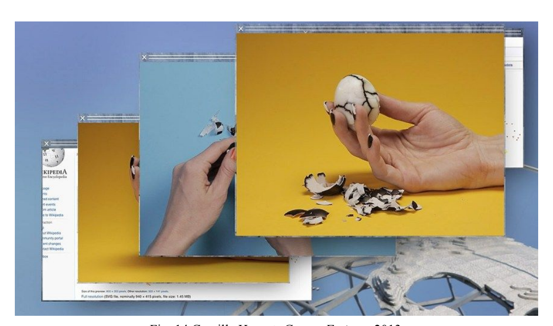
Fig. 14 Camille Henrot, Grosse Fatigue, 2013

Parallel narrative in Post-Internet art is an artists' response to people's increasing ability to digest multisource information simultaneously. In Camille Henrot's work Grosse Fatigue (Figure 14), she challenges herself to tell the story of the origin of the universe. In the video there are many layers of images which emerge and overlap with each other mimicking pop-up windows on computers. The artist states that the video performs an "intuitive unfolding of knowledge."<sup>15</sup>