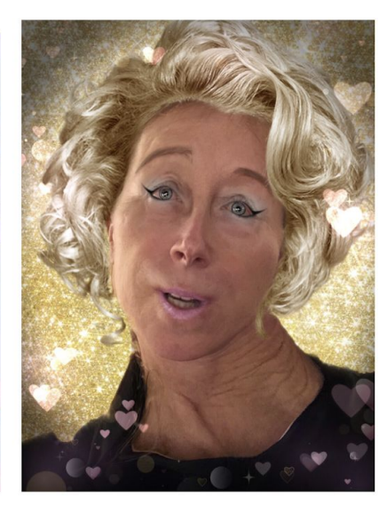
Fig. 18 Cindy Sherman's selfie on Instagram, 2017-18