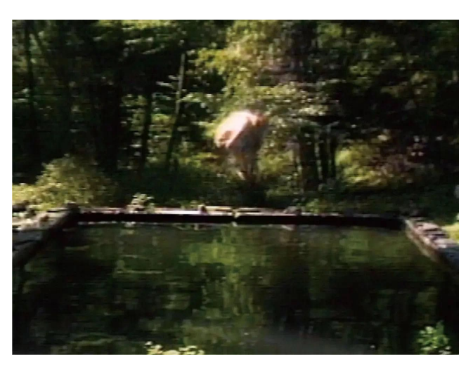
Fig. 11 Bill Viola, The Reflecting Pool, 1977-79