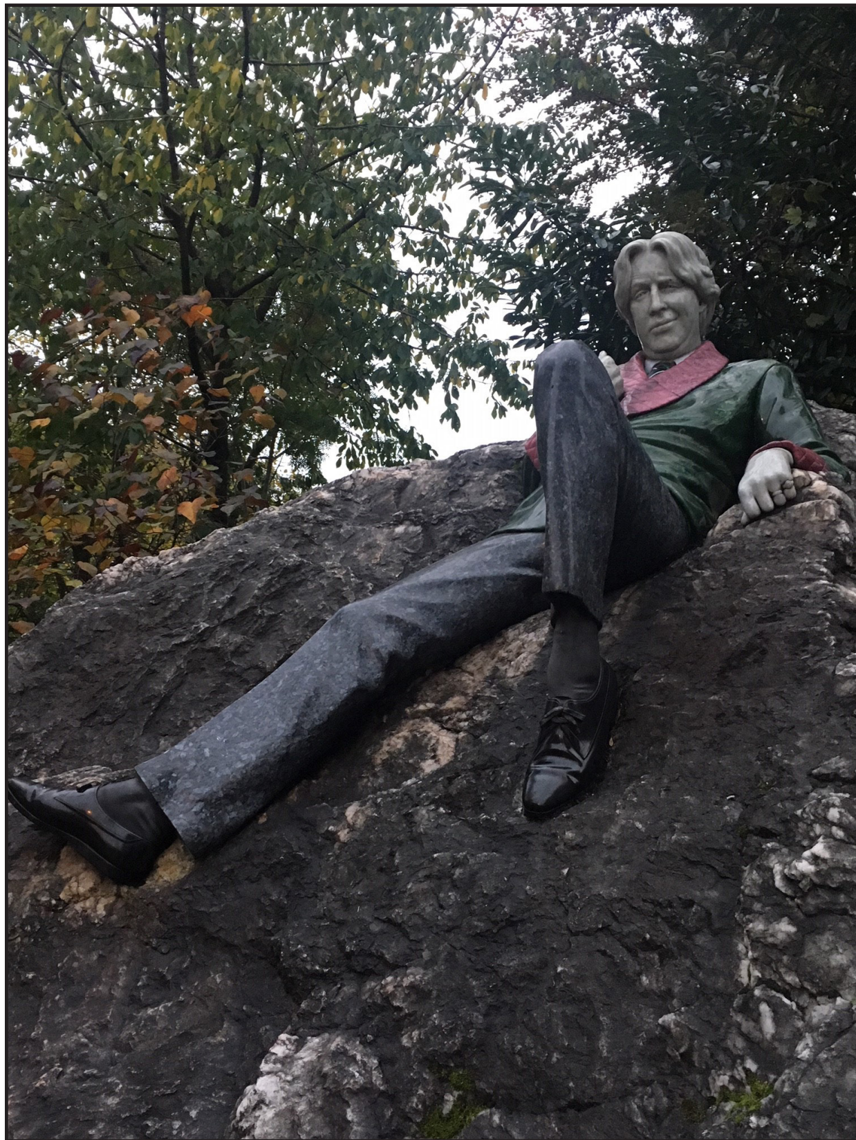
Statue of Oscar Wilde in Merrion Square, Dublin, Ireland.