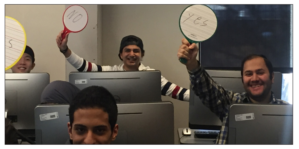
Figure 4.1. Audience using response boards

Finally, anyone learning a new language, international student or no, may feel shy or uncertain about using that language in front of an unknown native speaker (i.e., you or the librarian guest-lecturer) who cannot yet be trusted not to judge or ridicule their pronunciation and diction.<sup>5</sup> In the interests of scaffolding learning (the students are enrolled in an English language program to learn to write and speak English, after all) but in a way that reduces student discomfort, several strategies can be employed. When possible, provide time for students to collect their thoughts before answering a question; this can be done via methods such as think/pair/share and group presentations. Audience response boards, as in figure 4.1 below, have the dual benefit of increasing participation in students nervous about speaking in front of the librarian and preventing the more confident students from dominating a class discussion. Above all, avoid putting individual students on the spot by asking them to extemporaneously answer a question; the one exception to this guideline is that such questioning is an effective classroom management technique if students are off-task.