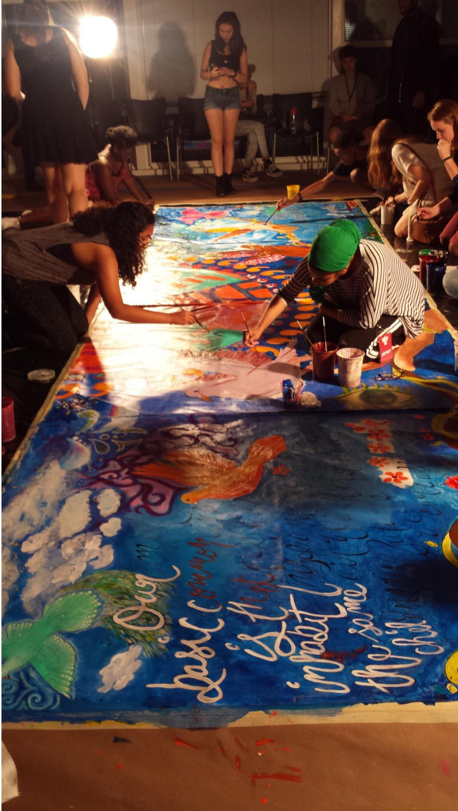
Figure 6. Second night of painting – the mural is coming together