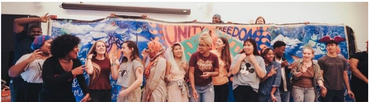
Figure 8. BSU and UMD students with finished piece at BSU art studio building