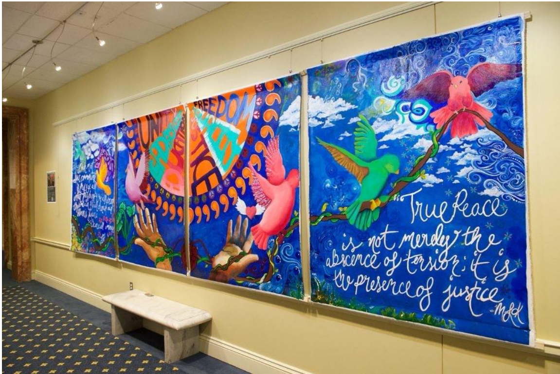
Figure 7. Mural at the Maryland House of Delegates in Annapolis, MD 2018