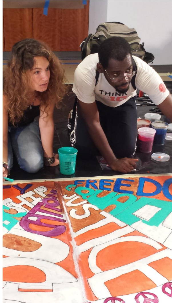
Figure 5 and 5B. Community members painting at the art festival