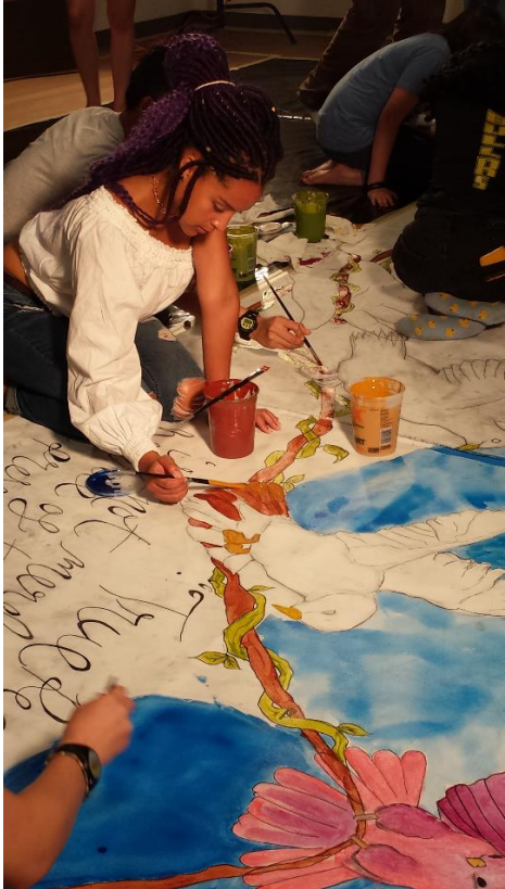
Figure 4 and 4B. The community painting begins