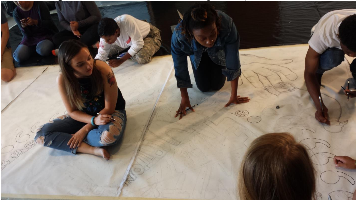
Figure 3. BSU and UMD artists sketching out the design on canvas