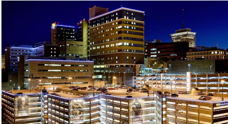
VCU Medical Campus