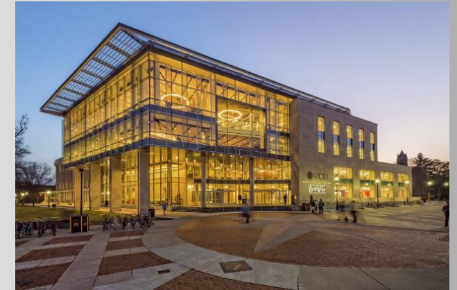
Monroe Park Campus