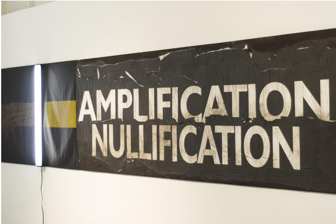
Figure 3 MY EYES DUE SEE , Wheatpaste installation view

Blackness does not exist without whiteness, they are slaves to one another, chained by the tooth. White terror amplifies blackness by creating portals for black and white folk to pass through intermittently. When we pass through this portal of amplification in reference to white terror, we arm ourselves and our hair grows long and tightly curled, loc'd and braided. Our hair remains a signifier of our allegiance to blackness, our allegiance to whiteness, and our allegiance to self. Although I wish it was that simple to distinguish which of us are for the progression of our culture, it is not so clear, but allegiance to celebrating your physical appearance without the beauty standards of other cultures is step one. Also, I am aware there is not one way to be a black