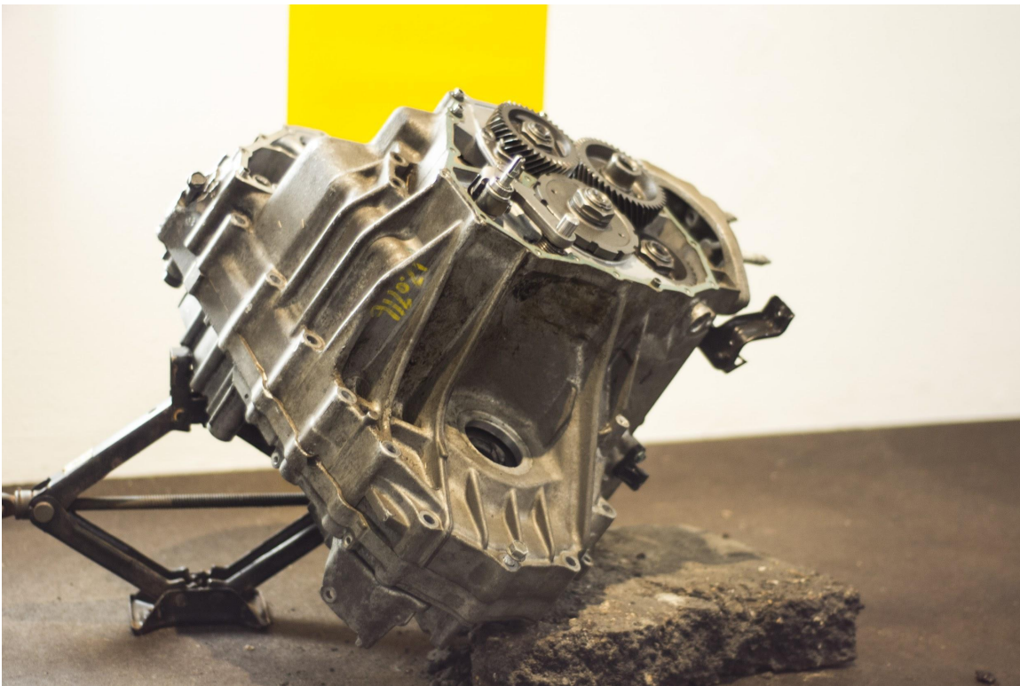
Figure 6 MY EYES DUE SEE , detail image of transmission

suspicious and most importantly don't be you. The lineage of being able to buy a car is also interesting because when democratic access to vehicles became available to Americans we were denied access to purchase. When we were able to afford a vehicle, there had to be a cheat code or a workaround for us to purchase a car, such as a "front-man," which was most likely a white man who would purchase a car on our behalf.