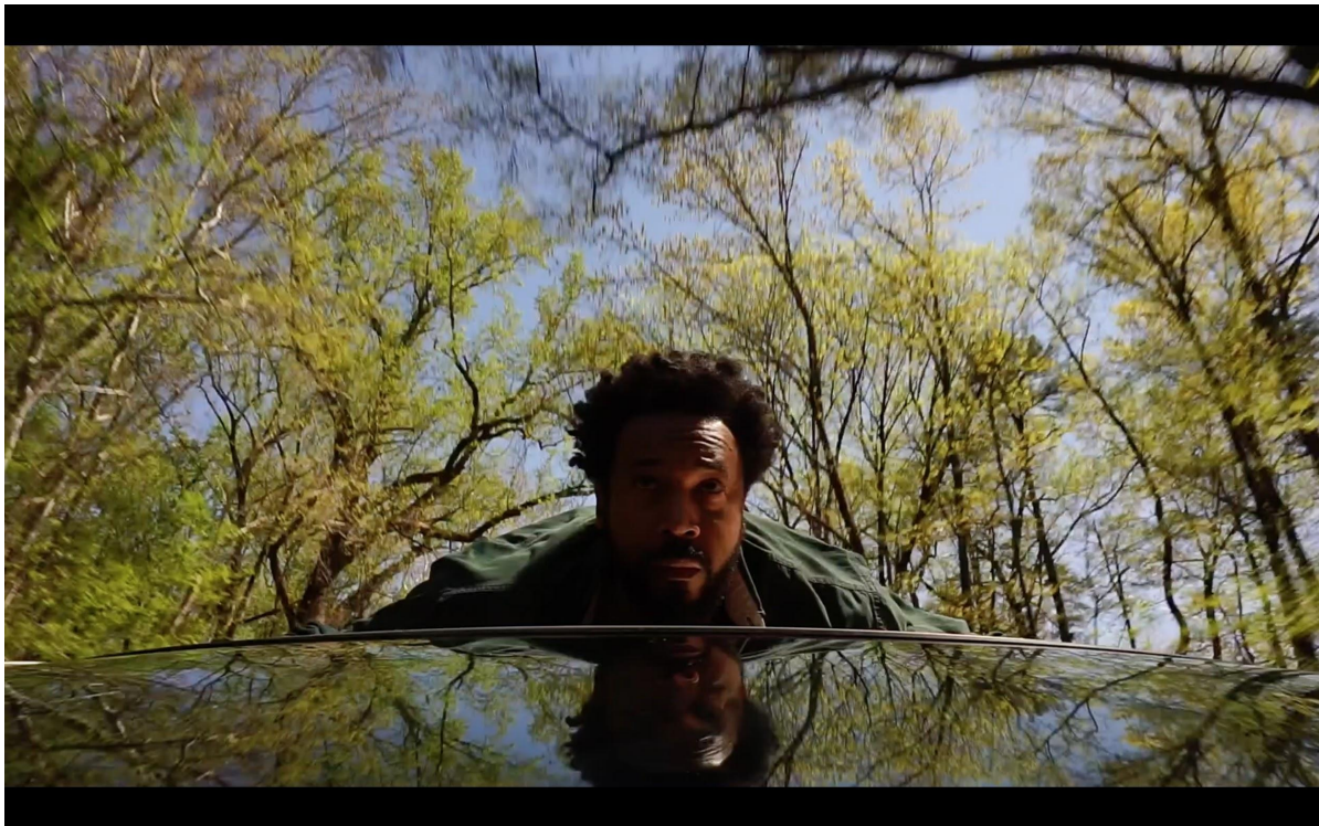
Figure 4 MY EYES DUE SEE , still image from single-channel video

person in America, but certain decisions are clearly in response to how others view you. We were taught to hate our natural hair since the beginning of our time in America and we have yet to fully recover from generations of our blackness being nullified. We are not our hair but our hair is and will remain.