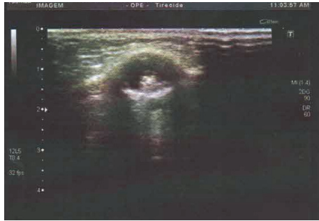
FIGURE 1: Sonography shows an image suggestive of thyroglossal duct cyst containing debris and an eccentric small hyperechoic solid area.

this distinction can play a crucial role in treatment decisions regarding the inclusion of thyroidectomy as part of the treatment strategy versus TDC total resection exclusively [13].