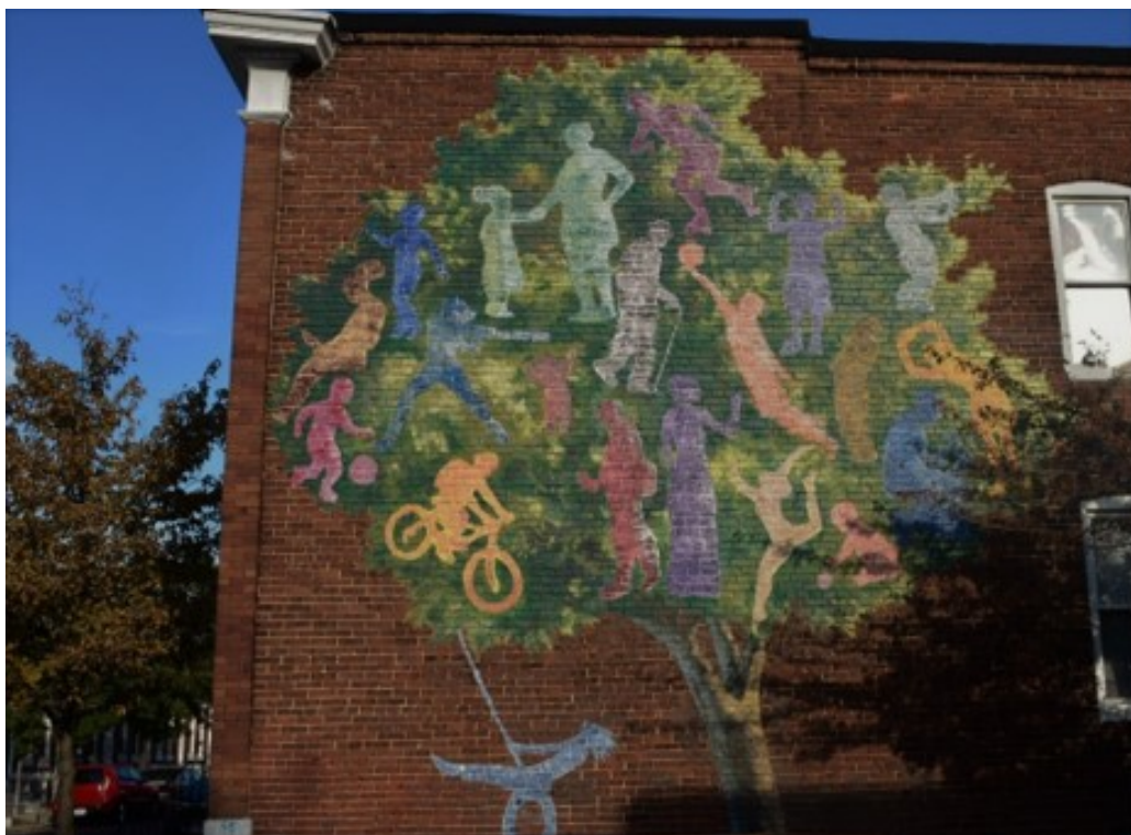
"Whitridge Ave Mural" Taken at 401 Whitridge Ave, Baltimore, MD on October 7, 2017