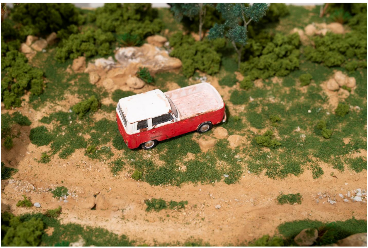
Figure 14. Zitrone (scale model detail) 2019. Mixed media. Dimensions Variable.