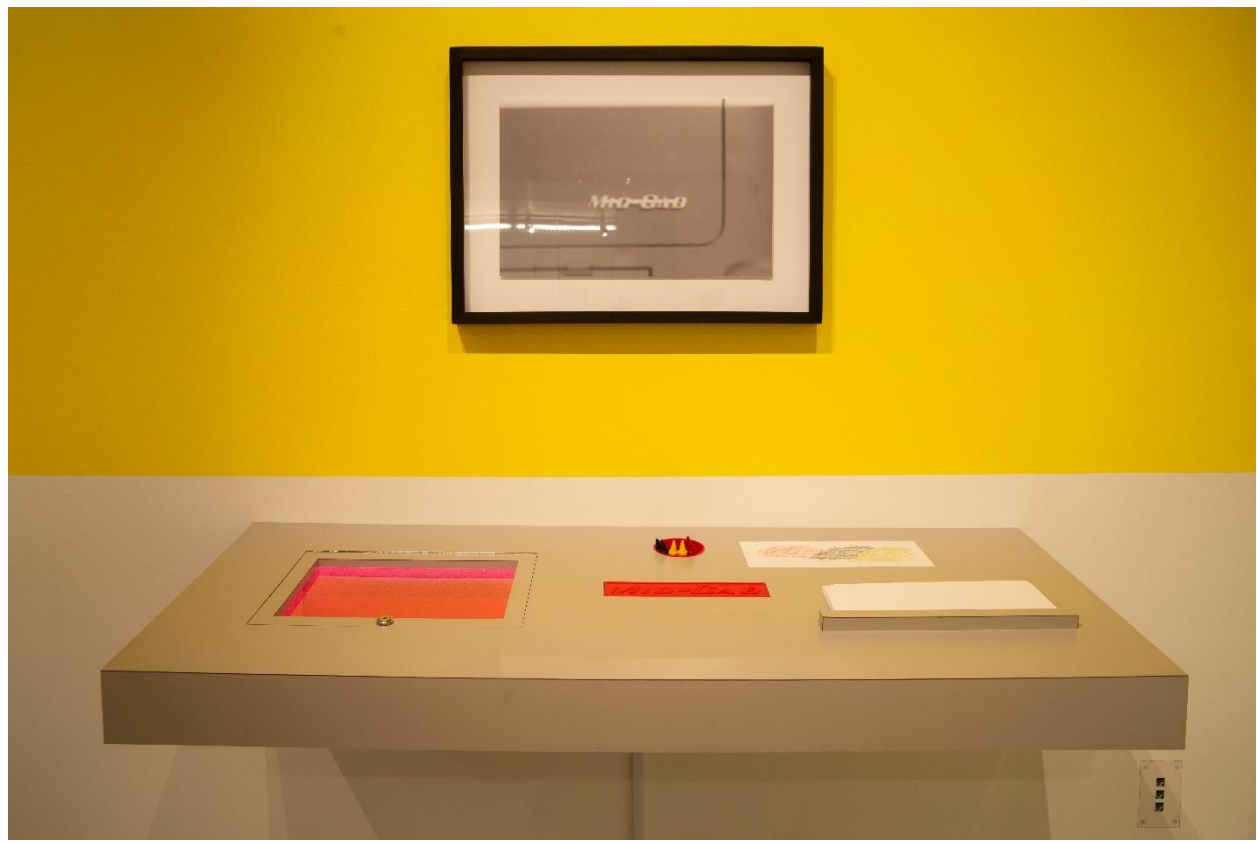
Figure 10. Zitrone (badge re-creation) 2019. Mixed media. Dimensions Variable.