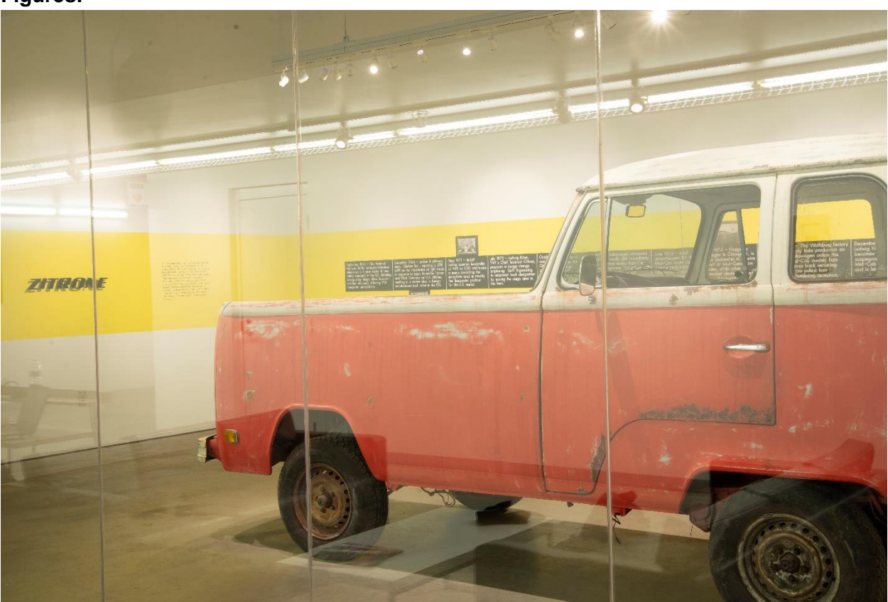
Figure 1. Zitrone (installation view) 2019. Mixed media. Dimensions Variable.