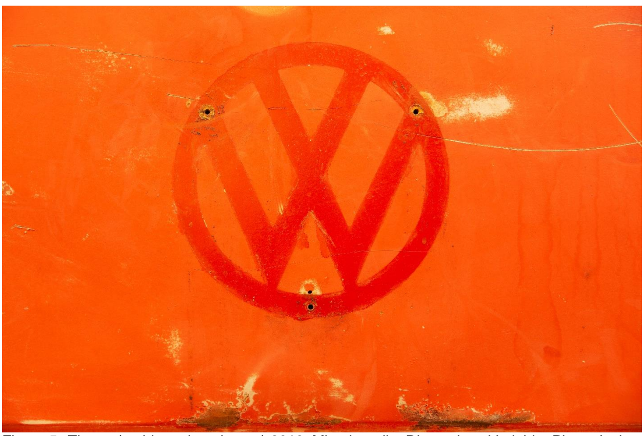
Figure 5. Zitrone (emblem ghost image) 2019. Mixed media. Dimensions Variable.