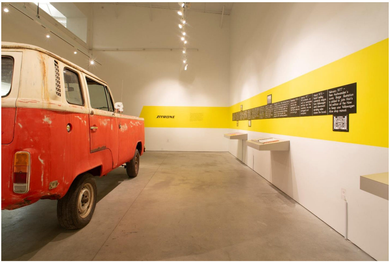
Figure 2. Zitrone (installation view) 2019. Mixed media. Dimensions Variable.