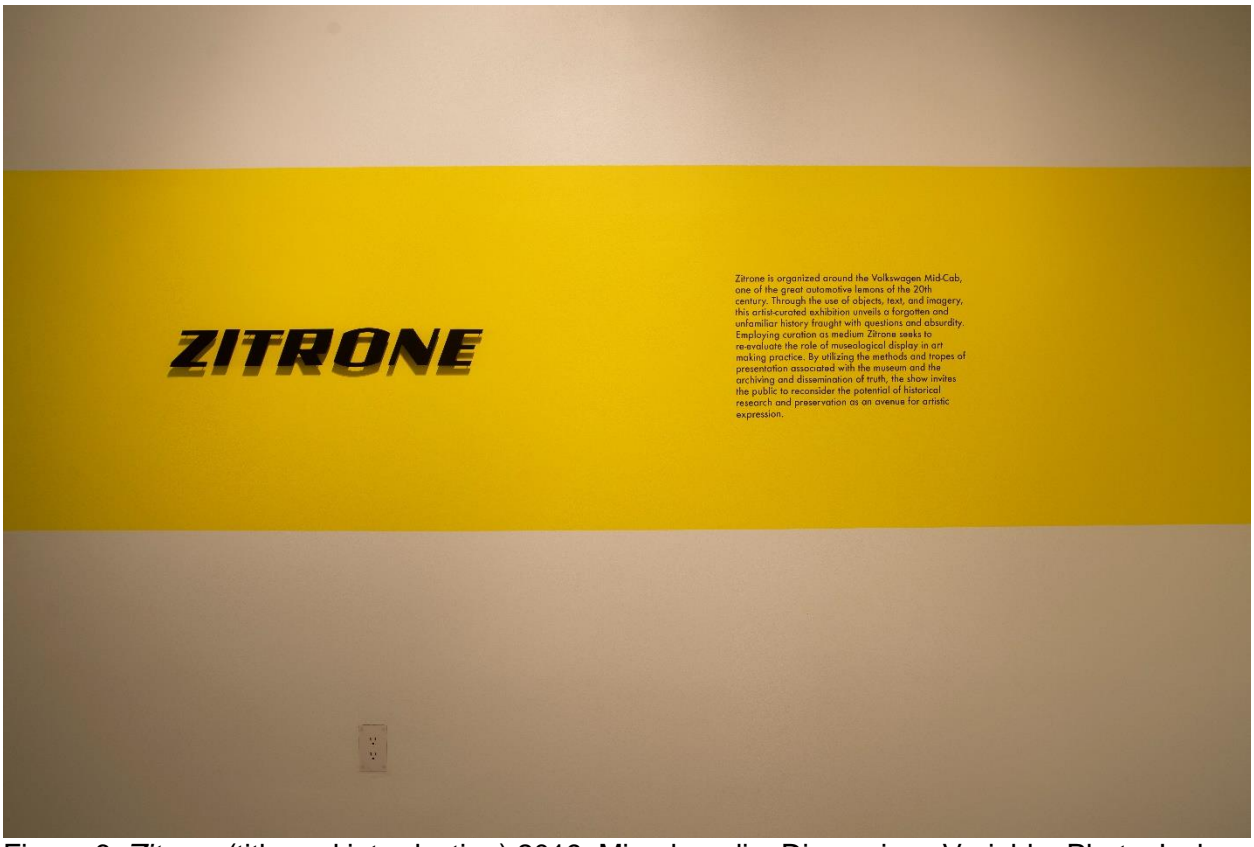
Figure 6. Zitrone (title and introduction) 2019. Mixed media. Dimensions Variable.