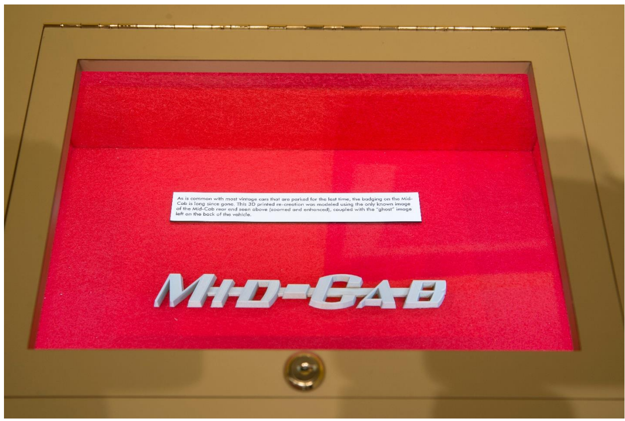
Figure 11. Zitrone (badge re-creation detail) 2019. Mixed media. Dimensions Variable.