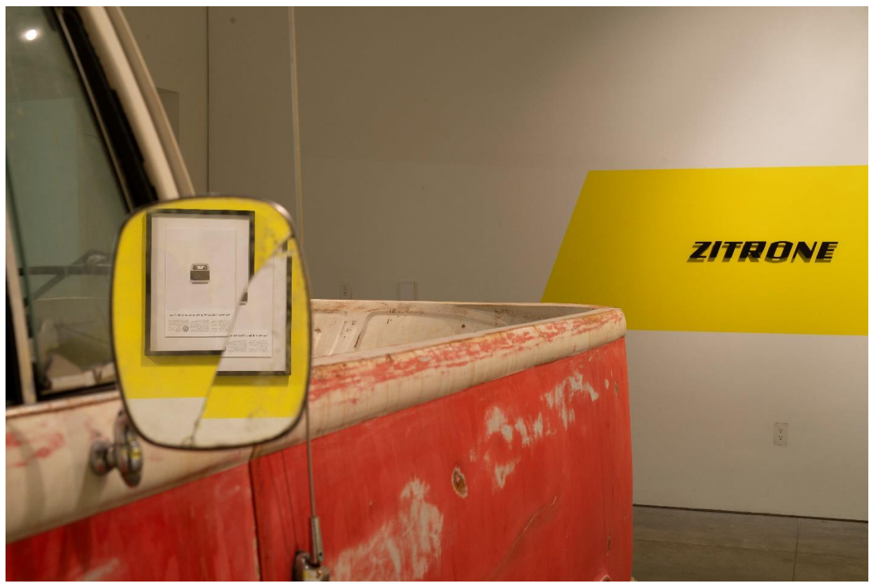
Figure 15. Zitrone (installation view) 2019. Mixed media. Dimensions Variable.