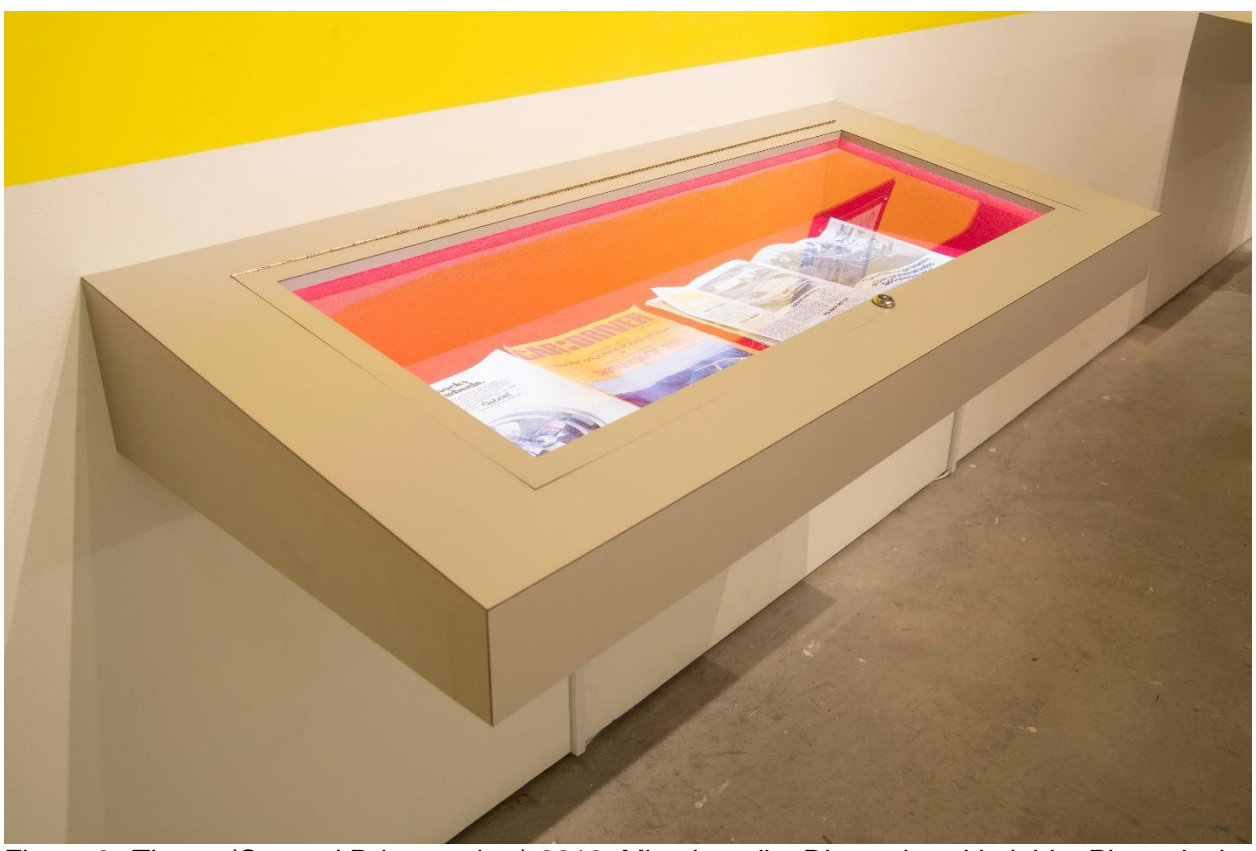
Figure 8. Zitrone (Car and Driver review) 2019. Mixed media. Dimensions Variable.