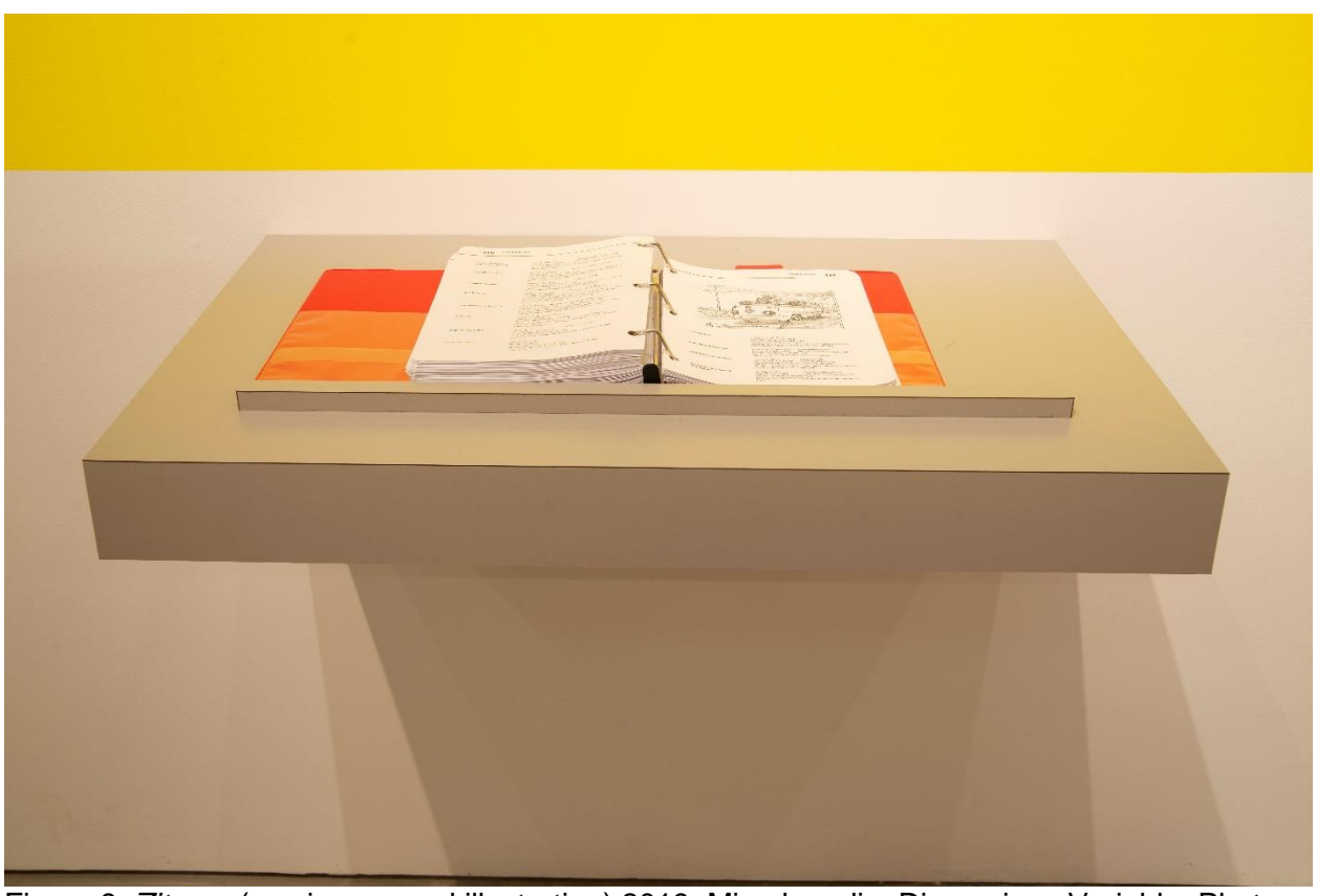
Figure 9. Zitrone (service manual illustration) 2019. Mixed media. Dimensions Variable.