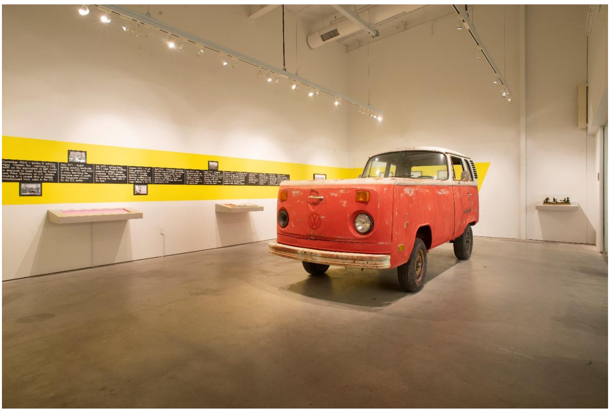
Figure 4. Zitrone (installation view) 2019. Mixed media. Dimensions Variable.