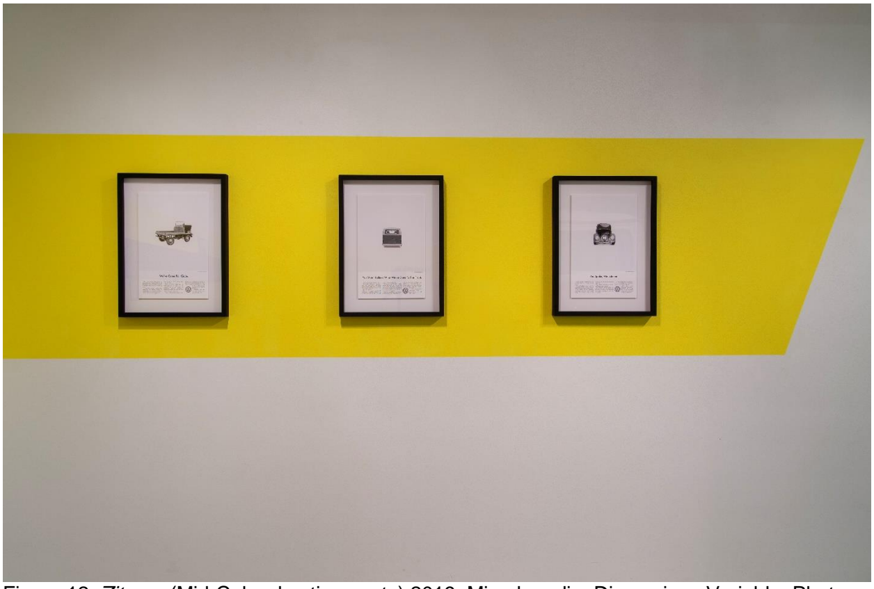
Figure 12. Zitrone (Mid-Cab advertisements) 2019. Mixed media. Dimensions Variable.