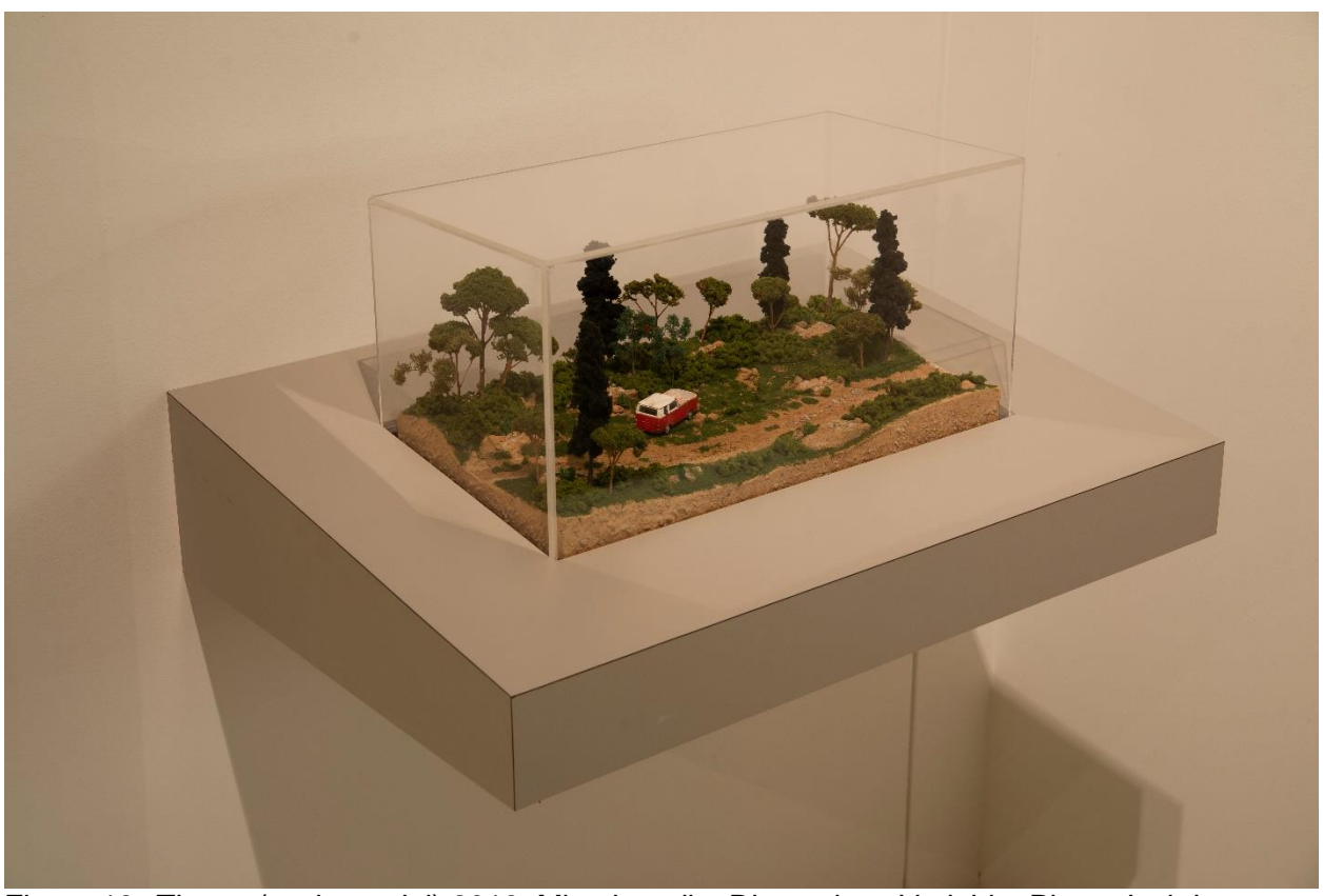
Figure 13. Zitrone (scale model) 2019. Mixed media. Dimensions Variable.