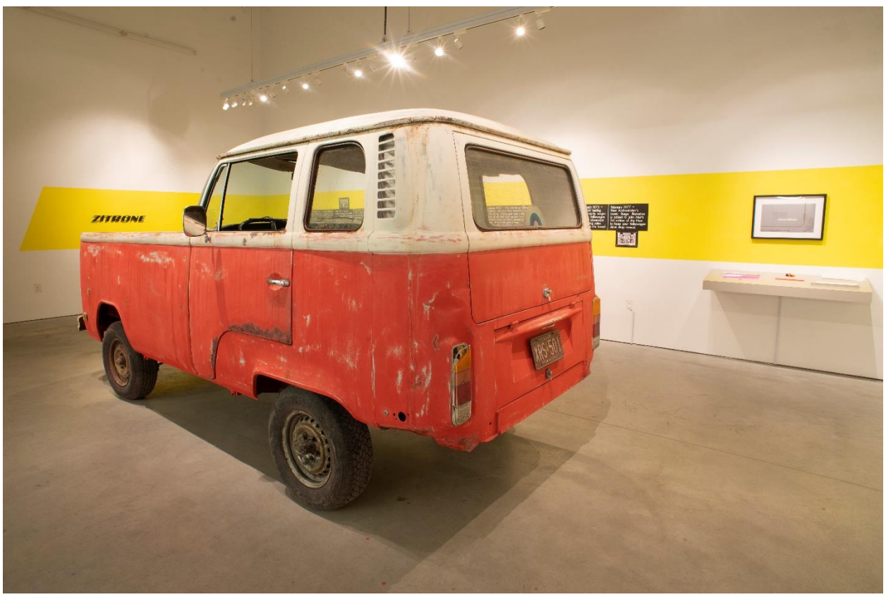
Figure 3. Zitrone (installation view) 2019. Mixed media. Dimensions Variable.