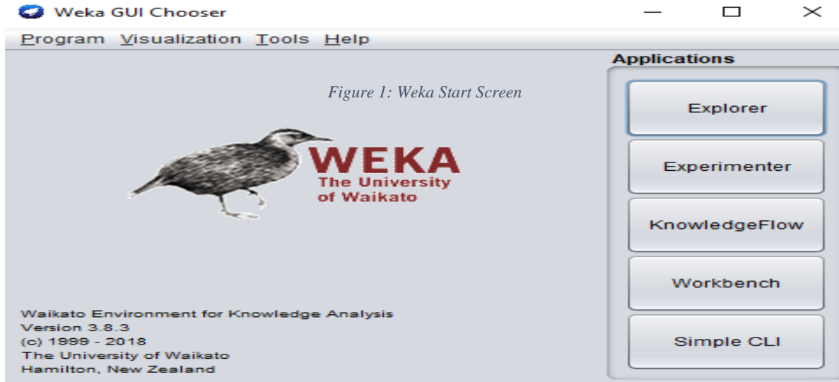
Table 3.5: Weka Classifier Program

Now we need to use the features calculated from the Emotional Score Module to train a machine learning classifier to predict which articles are real and which articles are fake. For this, we used a classifier package called Weka or the Waikato Environment for Knowledge Analysis developed at The University of Waikato in Hamilton New Zealand [4].