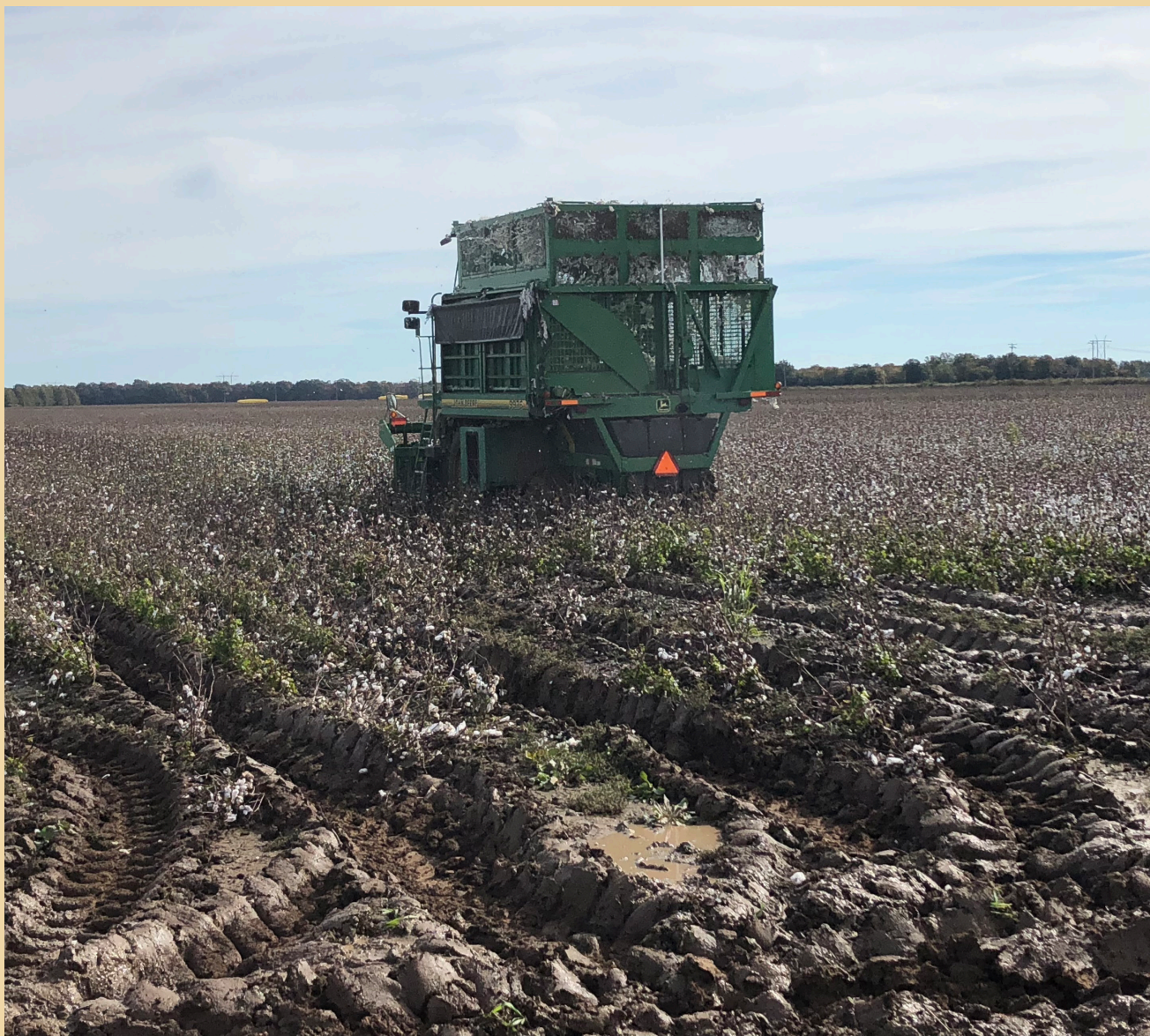
Wet fall conditions in 2018 led to rutting of many Arkansas cotton fields