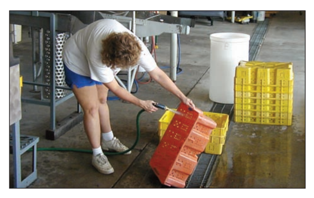
Post-Harvest Water Quality

Grapes are unique in that very little water is used in handling them after harvest. However, because water for postharvest operations can be a significant source of contamination with most produce, it is important that all producers be aware of the ways water used in post-harvest handling can contribute to fruit and vegetable contamination.