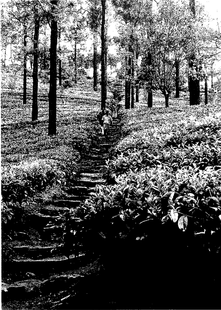
Figure 1. The steep, stone paths that cut through the acres of tea bushes on an estate in Kandy district