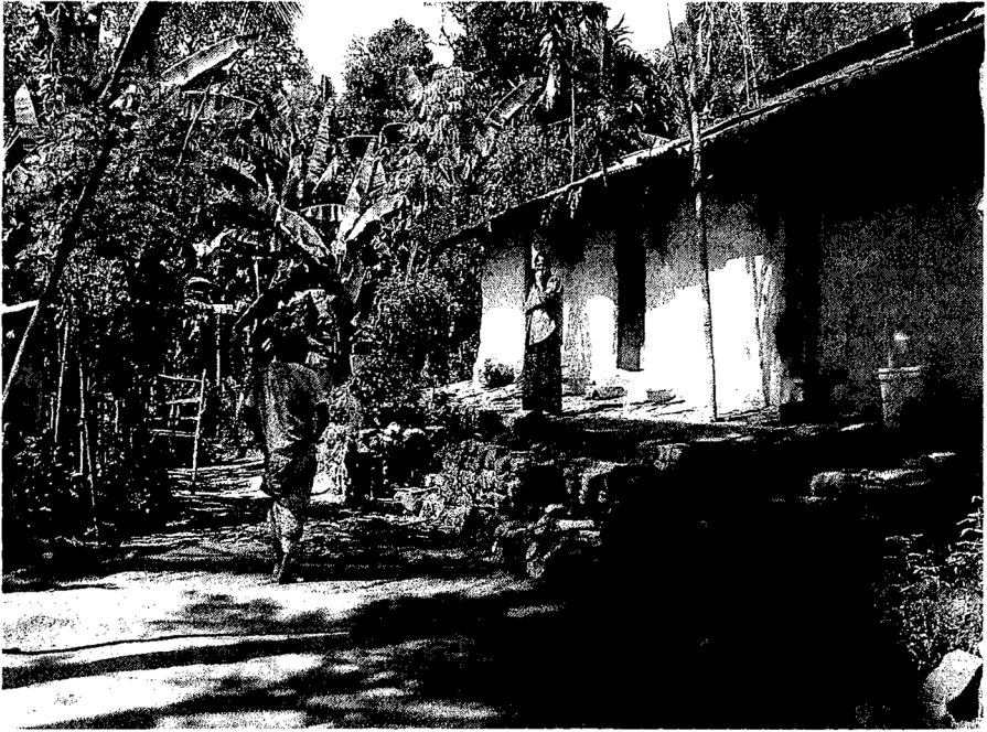
Figure 3. Line rooms on a tea estate in Kandy district

and Sri Lankan Tamil brands of nationalist politics, excluded Malaiyaha Tamils from any form of sustainable and redeemable political representation despite concrete leadership presence on Parliament, Provincial and Municipal Council levels. Once "coolies", then stateless, Malaiyaha Tamils had become minoritized beyond the "margins of the state" (Das and Poole, 2004). This topos manifests in a range of scholarship on Malaiyaha Tamil pasts (Vije, 1987 ; Moldrich, 1989, Vanden Driesen, 1997) and futures (Annaraj & Caspesz, 2004 ; Caspersz, 1995 & 2005). All of these works, to some extent or another, claim that community goes on in its barest forms but would thrive beyond the enclosures of its fixed past, if it were to gain voice, political will, and, above all, human agency. The self-recognized community of Malaiyaha Tamils was being represented as a community that would actualize to its fullest potential only under the conditions of the appropriate