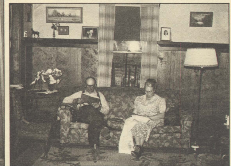
Top left: Lange's 1937 photo of migrants washing in an Imperial Valley spring. Top right: Lee's 1941 photo of housing project basins. Bottom left: Lange photographed these tenant purchase applicants in Stockton in 1938. Bottom right: Lee met this Placer County couple in 1940. Heavily in debt to the Federal Land Bank, they had not picked their pear crop, knowing there was no market for it.

When Lange was laid off from the FSA in 1940, the West Coast lost its resident photographer. She was not replaced, but Russell Lee did make two trips to California, one in 1940 and one in 1942, and his pictures show a world different from Lange's. Lee had joined the Resettlement Administration in 1936 and spent most of his early years with the agency concentrating on the rural Midwest. The son of a prosperous Illinois farmer, Lee had grown up in the corn-fed world of the American Scene, and his photographs reflected a much gentler view of life. His