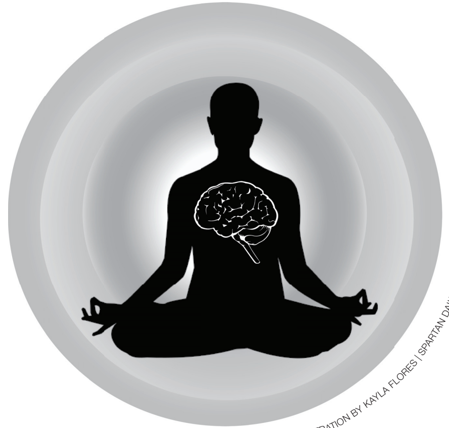
ILLUSTRATION BY KAYLA FLORES | SPARTAN DAILY

Those opposed to teaching mindfulness in schools take the stance that we are only help-