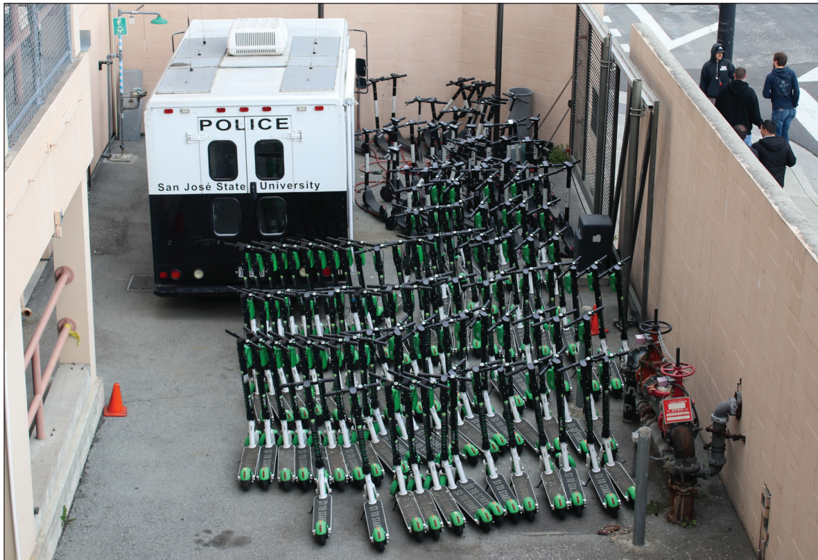
At least 91 Lime and 55 Bird scooters were impounded by San Jose State University Police Department after formally banning them from campus. UPD will continue collecting abandoned scooters on campus.

Bird's scooters would only operate at one mile per hour