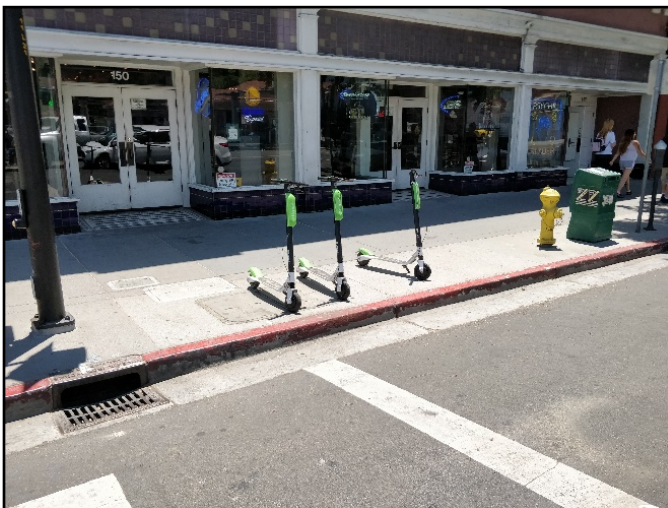
Scooters parked in the street furniture zone (left) and on the edge of a sidewalk (right)

Even among the 10% of sidewalk-parked scooters that failed to be tidily parked on the sidewalk edge or in the street furniture zone, most did not actually impede pedestrian traffic. An extremely small number of scooters—just 11—were observed blocking pedestrian travel in any way.