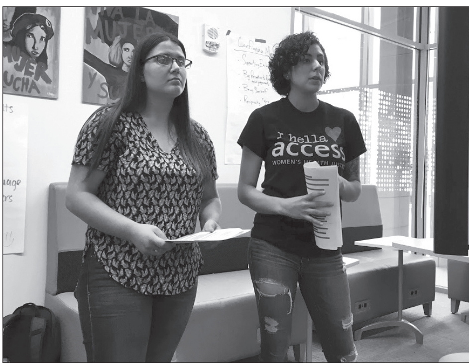
Panel organizers from the Chicanx/Latinx Student Success Center holds a forum the forum on the usage of the term "Latinx" on Thursday.